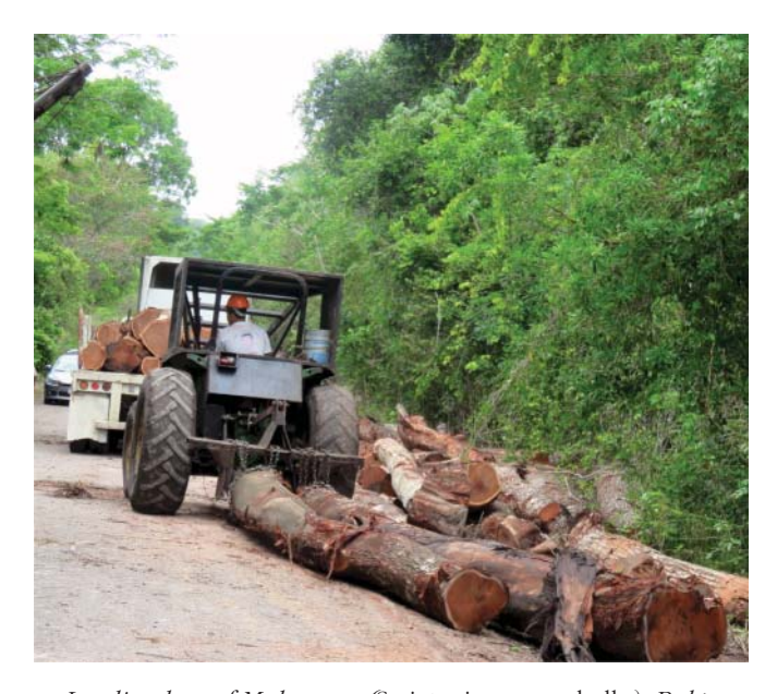
Loading logs of Mahogany (Swietenia macrophylla), Pukte (Bucida buceras) and Zapote (Manilkara zapota) in Ejido San agustín, Yucatán

Local people were strongly involved in the project. In total, the collaborating ejidos and communities accounted for more than 150 000 hectares of forest and encompassed various forest types and levels of organization. C&I for tropical forests in southeastern Mexico were developed in workshops with the participation of stakeholders involved in the management and harvesting of tropical forests. Efforts were made to obtain the