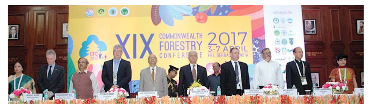
The opening ceremony at the Commonwealth Forestry Conference