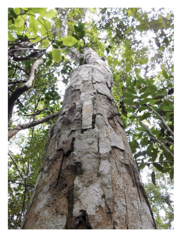
Dalbergia Stevensonii adult tree in Ruta del Mono, Petén, Guatemala

Nevertheless, there is often a lack of information on the extent of listed species and their distribution in the region, as well as on their regeneration and ecology. In addition, there may be insufficient capacity and resources in CITES Management Authorities with respect to monitoring, control, transparency, and communication and information systems. To fill such gaps, the ITTO–CITES Programme has been helping to build capacity and conduct studies where information is lacking.