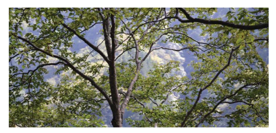
The Global Trees Campaign recently collected seeds from populations of Japanese critically endangered, Betula chichibuensis

Description of the answer to a question that has long baffled botanists: How many tree species are there in the world? The answer is 60,065.