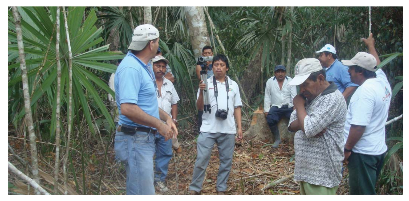
A peer-to-peer learning excercise between Ejido members at Ejido 20 de Noviembre, Campeche

The project implemented and validated C&I in nine forest management units (FMUs) in humid and subhumid tropical forests. The aim was to evaluate and monitor economic, social and ecological aspects of forest management in those ecosystems and thereby to establish a scientific basis for sustainable forest management.