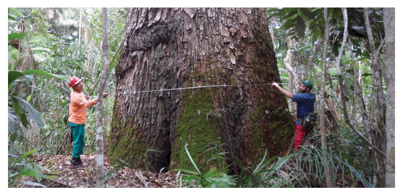
Measuring stem diameter growth of cedrorana (Cedrelinga catenaeformis) (3,61 cm DBH) at Marajoara, Pará, Brazil

Since 2007, ITTO and CITES have been implementing a collaborative initiative, the ITTO–CITES Programme for Implementing CITES Listings of Tropical Tree Species with the aim of ensuring that international trade in CITES-listed tree species is consistent with their sustainable management and conservation and to increase the quality of information on listed tree species in order to facilitate better forest policy and planning. Maintaining a sustainable trade is important, both for the economies of range states in Latin America and as a way of promoting sustainable forest management (SFM) and conservation.