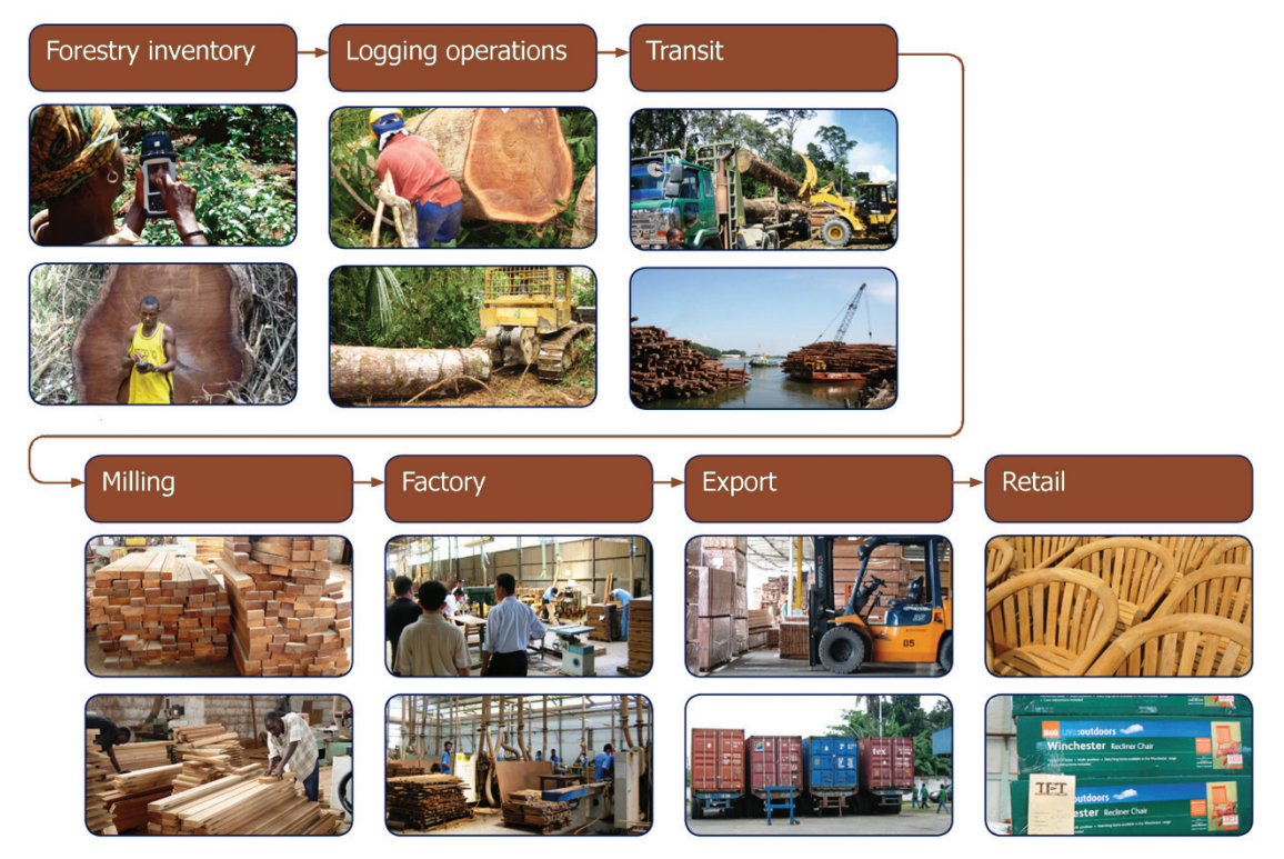
Figure 1: Typical supply chain