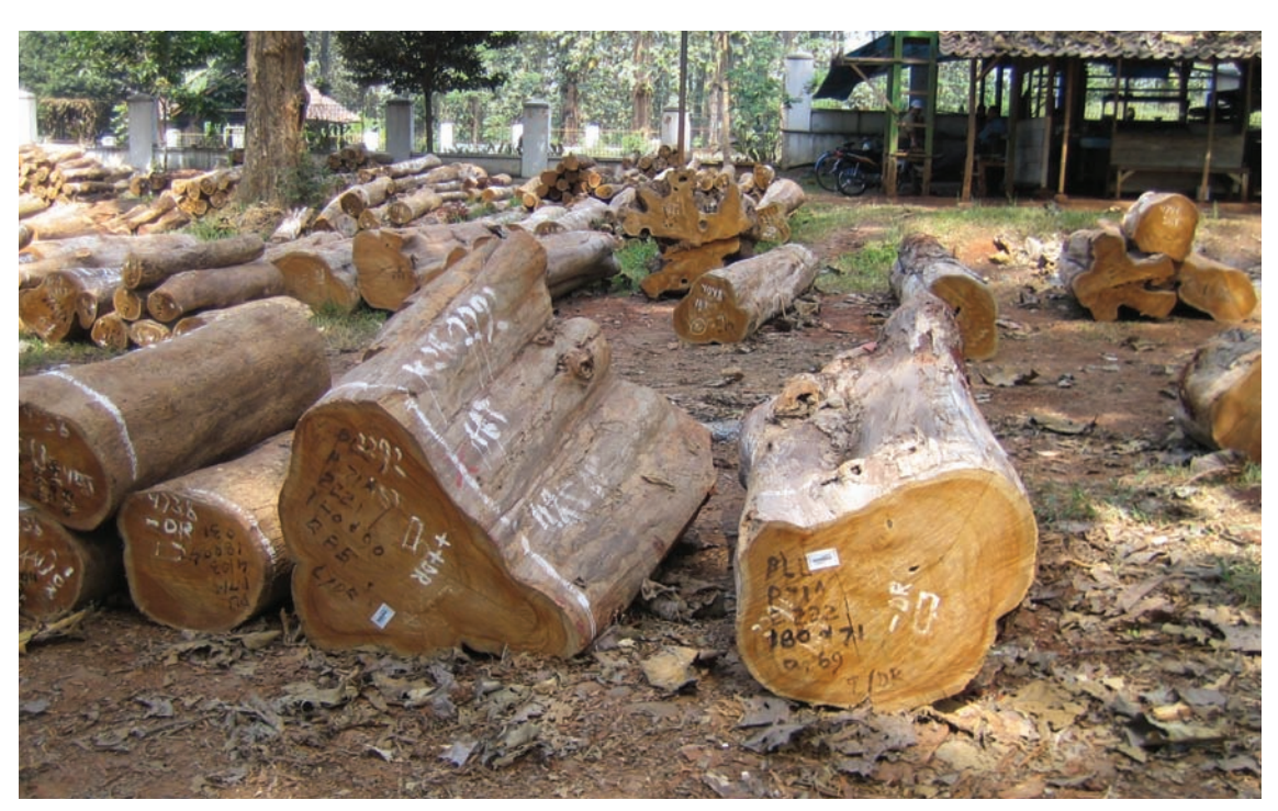
Figure 6: Examples of paint marking and barcoding