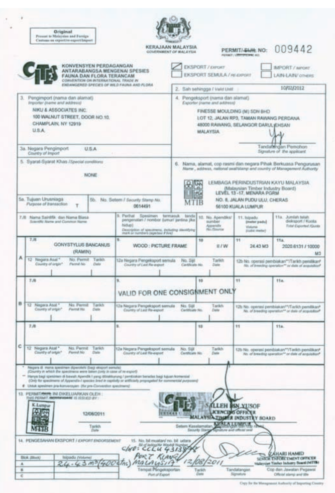
Figure 3: CITES permits provide proof of timber identification

Voluntary Partnership Agreements (VPAs) form a key component of the EU FLEGT Action Plan and are bilateral agreements with the EU and producer country partners. VPAs aim to guarantee that wood exported from partner countries to the EU is legal in origin. This is achieved by developing robust legal frameworks which are enforceable and that reflect the social, economic and environmental objectives of the partner country. A fundamental component of the agreement is a Legality Assurance System (LAS) with the function to identify, monitor and license legally-produced timber, ensuring that only timber of legal origin is exported to the EU market. Mechanisms of controlling the supply chain and its verification are core to the LAS where timber tracking systems can demonstrate the legality of timber at each stage and mitigate the risk of unverified timber entering the supply chain. Currently 6 countries are developing systems agreed under the VPA, with 4 countries negotiating with the EU and 15 countries from Africa, Asia and Central and South America are expressing an interest in the process.