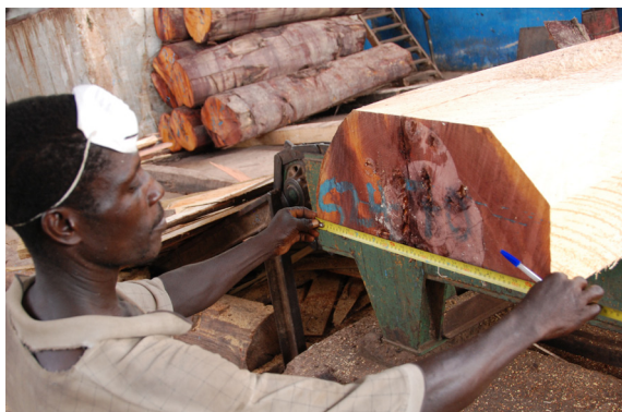
Timber measurement at a sawmill in Ghana - improving the quality of data at every stage of the supply chain is a key part of the FLEGT VPA process.

ITTO has appointed a Lead Consultant based in Europe to develop work plans and co-ordinate data collection and analysis. ITTO is expanding its statistical and data analysis capacity, hosted in Japan, to align with the objectives of the IMM. Building on ITTO's existing network in tropical timber trading countries, IMM is establishing correspondents in each VPA partner country and in priority EU markets for VPA licensed timber. Correspondents are responsible for regular data collection and assessment of market conditions and product prices.