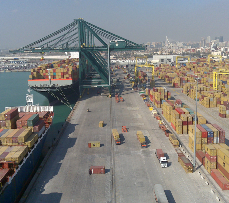
Valencia Port Spain. FLEGT VPA licenses are checked by customs at EU port of arrival. Timber with a valid license is considered legal under EUTR.

IMM will progressively widen the scope of monitoring against the indicators in liaison with VPA countries and other stakeholders as more licensed timber becomes available, market awareness rises, and market monitoring capacity is established.