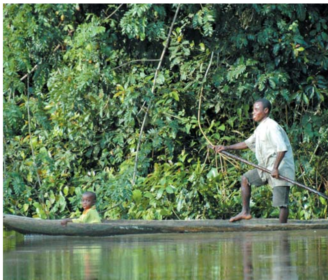
Local transport on the Dzanga River, Republic of Congo.

ITTO'S WORK IMPROVES FOREST GOVERNANCE ALONG THE ENTIRE VALUE CHAIN FROM LOCAL COMMUNITIES & INDUSTRIES, TO NATIONAL GOVERNMENTS & INTERNATIONAL CONSUMERS BY PROMOTING LEADERSHIP & ENHANCING TRANSPARENCY.