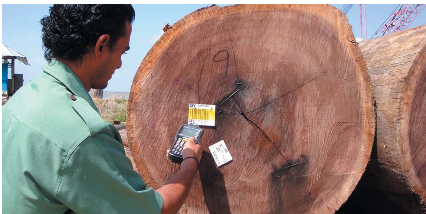
Timber tracking in Guyana.