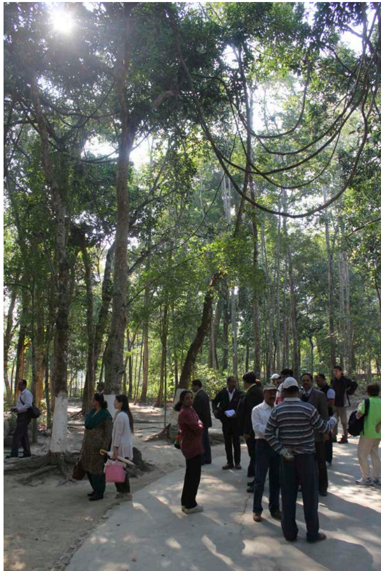
Workshop participants visit a municipal park, where agarwood-producing trees grow in abundance as part of a mixed forest.

Guwahati, Assam, India, 19–23 January 2015