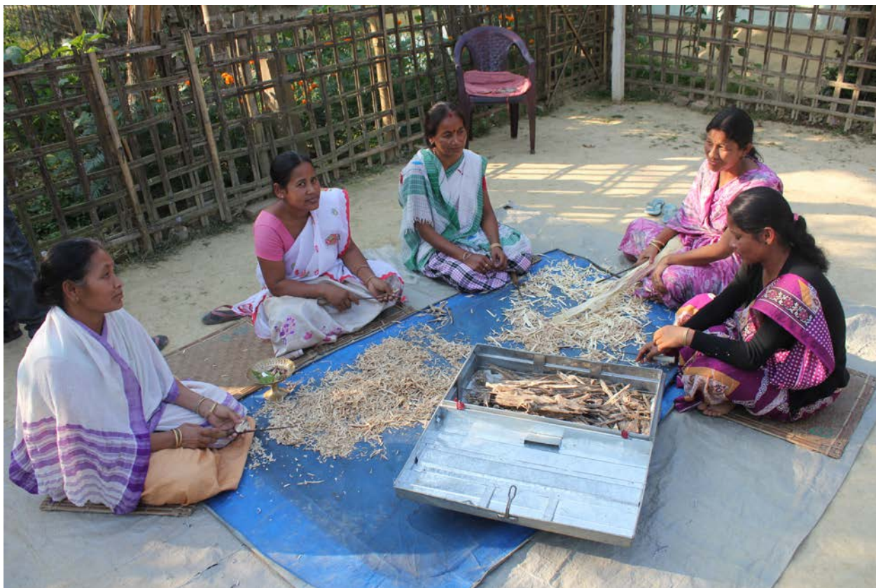
Workers extract agarwood from plantation-grown agarwood trees in a village in northeastern Assam.

Workshop participants visited plantations owned by Ajmal Agarwood, and various other plantations and gardens. They were also able to observe local women working to extract agarwood from plantation-grown wood, and a local enterprise that extracts agarwood oil from agarwood chips.