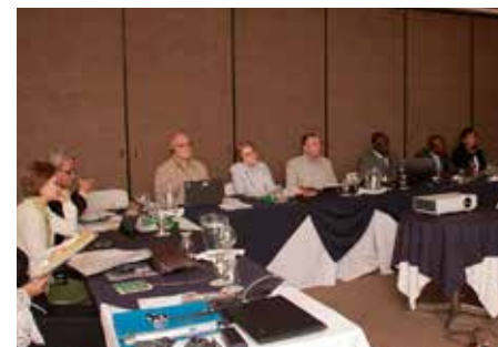
Participants of the Expert Working Group Meeting in Antigua, Guatemala, 16-19 September 2015.