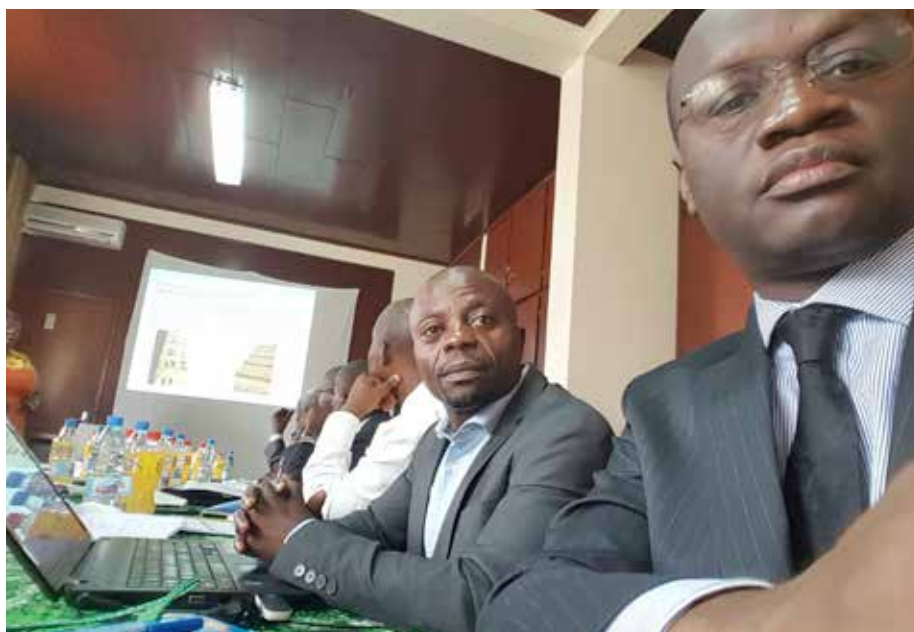
Third meeting of the Scientific Committee for the Activity “Law enforcement and management of P. elata in production forests in Cameroon”, Yaoundé, 11 March 2016.

The Activity commenced implementation in April 2014 and was completed in April 2016. It seeks to demonstrate that through the use of DNA techniques Pericopsis timber could be traced back to specific trees from the controlled Forest Management Units (FMU). ANAFOR had organized the second National Technical Committee meeting in October 2015. All field activities planned under the Activity have been achieved and samples have been analyzed by Double HELIX. The Activity encountered big delays due to problems of communication between the importing country (where the bark is being analyzed) and the Cameroon CITES authority regarding the issuance of CITES permits to allow the samples to be shipped. ANAFOR had organized the final National Technical Committee on 14 March 2016 and also organized a review and evaluation workshop on 2 April 2016.