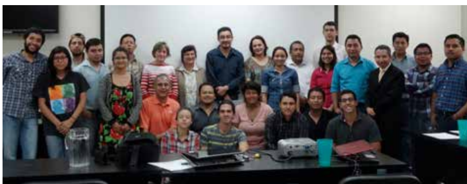
Workshop on wood identification using NIRS technology, 21-22 February 2016, Guatemala City.

The Activity supported a resource assessment of red cedar in Guyana’s forest estate to establish the status of the species; increased understanding of the conservation status of red cedar; and increased capacity in Guyana for managing red cedar and for CITES reporting. A diagnostic of the reporting framework was completed for the issuance of forest permits and in monitoring which includes most elements for an effective chain-of-custody management system for forest products. The Activity had made recommendations for strengthening and improving the management of the supply and production chain.