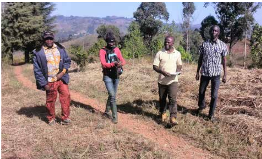
The RC and the Division Delegate of Forestry and Wildlife of the Bui division visiting a new private farm of Prunus africana in Kumbo.

inventories, setting fair tracking system, silviculture (nurseries and plantations), training harvesters on the use of good techniques, and conducting research to better refine management parameters. Cameroon authorities have submitted a follow-up proposal to ITTO, with the aim to address the concerns expressed in this paper.