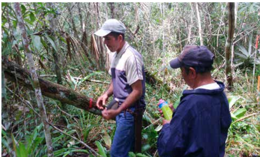
Tree measurement in a permanent sample plot.