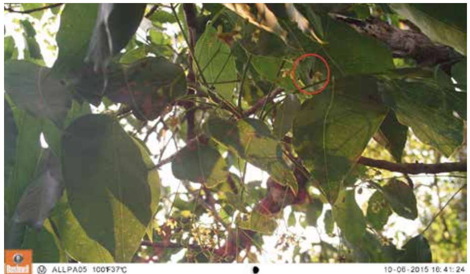
Mahogany tree flower with a possible pollinator taken by a camera trap set on a branch.

consisted of dasometric data and qualitative variables such as vigor, shape of the tree crown, sanitary condition, dominance, and infestation of lianas and jungle vine. It also included an evaluation of associated species to characterize the sites.