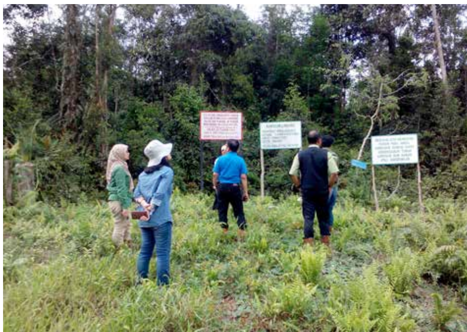
Field visit to the Estate Meranti, PT. Riau Andalan Pulp and Paper, Riau, Pekanbaru, 10 December 2015.