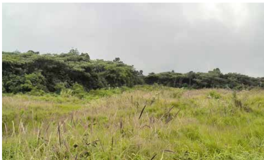
A view of the Mount Cameroon forests.

In conclusion, Cameroon Government has made many efforts to promote the sustainable harvesting of P. africana in the country, but many problems remain in terms of the implementation of the guidelines prescribed in the NDF or simple management plans. The assistance of the ITTO-CITES Program should include the phase of implementation of the simple management plans developed which included delimitation of annual plots on useful forests, conducting exploitation