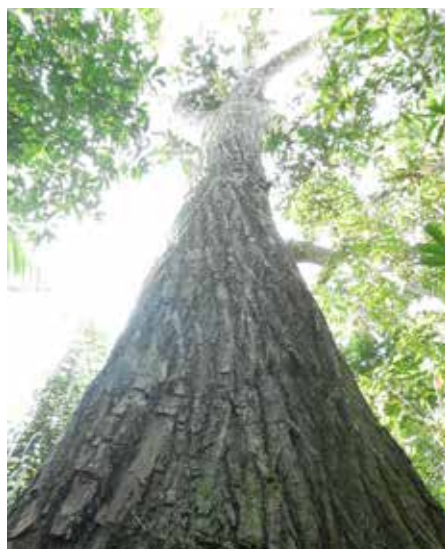
Adult red cedar tree in Guyana.

This activity is in its final stage of completion which is expected in June 2016. All field work has been completed, where a total of 25 mahogany trees and 33 cedar trees have been evaluated. Information collected