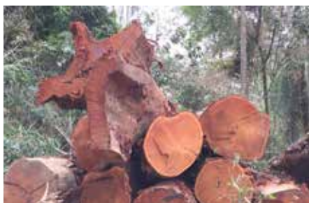
A single mahogany tree harvested and bucked in Fazenda Novo Macapá, Acre, Brazil.

Monitoring dynamics of remaining mahogany trees during the four-year period revealed a periodic annual increment of 0.7 cm \pm 0.8 cm ( N=27 ; \text{min}=0.01 cm; \text{max}=2.3 cm). Mortality was quite high (14%) for such a short period of observations. It is inferred that strong winds that hit the area combined