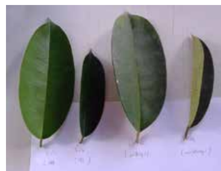
Morphological variation of ramin leaves collected at Ogan Komering Ilir, South Sumatra.

Currently, four technical reports are being finalized for publication, namely, (i) Morphology and Genetic Variation of Cuttings of Ramin in OKI, South Sumatra; (ii) Genetic Variation of Hedge Orchard of Ramin in OKI, South Sumatra and