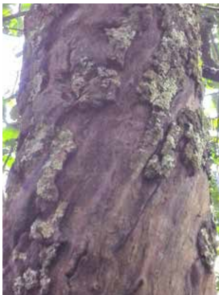
Prunus tree debarked with a bad technique in the MUTEF Community forest.