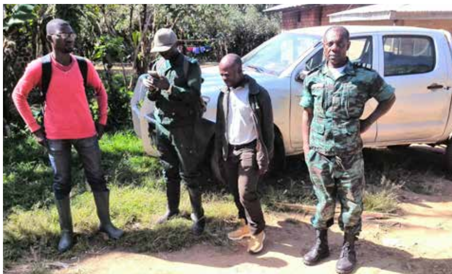
The Regional Coordinator and the Divisional Delegate of Forestry and Wildlife of Boyo, Fundong at the entrance of the community forest of MUTEF.

The mission noted some discrepancies (big differences) between the estimated annual quota and the real production in the Mount Cameroon PAU. But these differences can be explained through two facts: (i) sampling