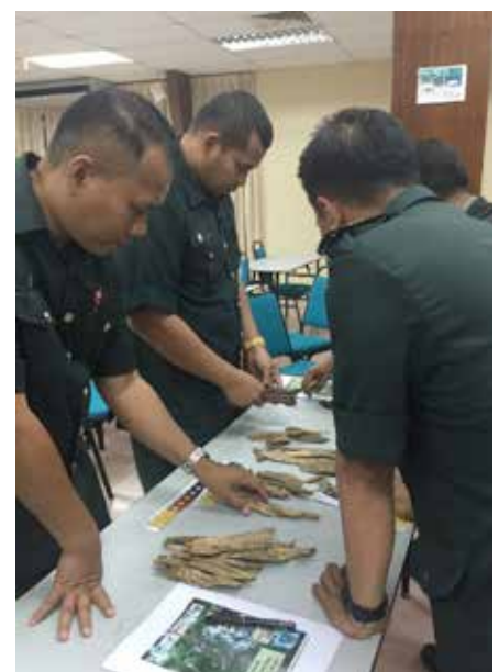
Training on the grading of agarwood.

In addition to the Completion Report of the Activity, six reports entitled (i) Manual for the Grading of Agarwood ; (ii) Manual for Identification of Aquilaria to Species Level ; (iii) Field-tested Manual for the Identification of Aquilaria to Species Level in Peninsular Malaysia ; (iv) Field-tested Manual for the Grading of Agarwood to be used by the Staff of FDPM ; (v) Syllabus on the Identification of Aquilaria to Species Level and in the Grading of Agarwood ; and (vi) Report on the Two Workshops on the Identification of Aquilaria to Species Level and in the Grading of Agarwood are being finalized for publication. These reports will be uploaded to the ITTO-CITES website once they are published.