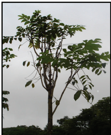
Bifurcated mahogany due to the attack of H. Grandella .

This activity began in July 2009 under the leadership of the Facultad de Ciencias Forestales (UNALM). During the first two months of activities, the methodology for characterization of mahogany and cedar populations has been analyzed and monitoring and periodic evaluation of these plots have been undertaken. The first coordination activities have been carried out to start fieldwork in the regions of Madre de Dios and Ucayali, which is planned to begin in the first fortnight of October 2009. Finally, cartographic and statistical information were collected and selected, which are helping to improve the existing database on mahogany and cedar.