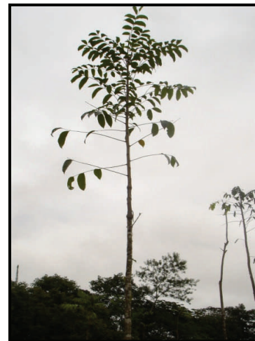
Appearance of the erect stem of mahogany after pruning of the branches

The Regional Coordinator for Latin America has established a proprietary extranet system (Information Management System) to improve the communication among the regional coordinators. Both the African and Asian regional coordinators are now consulting regularly with the Latin American coordinator to ensure both the program website and information available on the extranet is up-to-date. The extranet allows access to all program documentation (full activity proposals, correspondence, EC grant agreement and visibility guidelines, etc.) to the regional coordinators, ITTO and CITES.