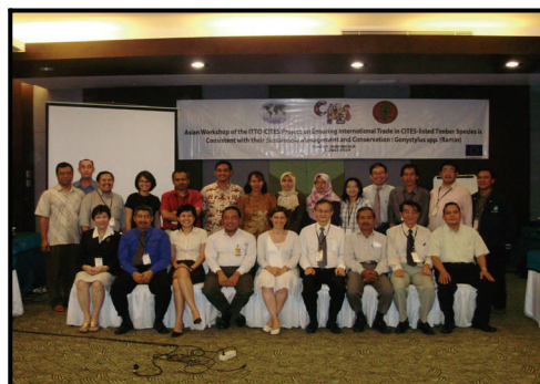
Asian Workshop in Bogor, Indonesia—July 2009.