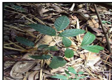
Natural regeneration of mahogany in the project area, UPA-R1

The study aims to establish silvicultural guidelines to be adopted in sustainable forest management plans of natural forests with the occurrence of mahogany in the Brazilian Amazon. The experimental research area is the Remnant Annual Production Unit (UPA-R1), with 1,620.6 hectares, which is part of the Project of Sustainable Forest Management with 186,000 ha, accounting for 97.8% of the total area from property called "Farm Seringal Novo Macapá" of 190,210 ha. In order to make the fieldwork easier during the census inventory (IF100%) of mahogany trees of 30 cm DBH, the area of the UPA-R1 was divided into four compartments, namely A, B, C and D. However, for the purpose of this research, the area of UPA-R1 was divided into two compartments (A + B) and (C + D). Thus, the census of mahogany trees in the area was carried out, where 110 trees were detected, of which 45 were selected for logging, 21 for future harvesting in the second cutting cycle, and 44 trees reserved as seed trees, which were mapped according to their geographical coordinates.