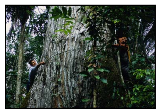
Mahogany tree measurement in the Brazilian Amazon.

The Regional Coordinator for Latin America has established a proprietary extranet system (Information Management System) to improve the communication among the regional coordinators. Both the African and Asian regional coordinators are now consulting regularly with the Latin American coordinator to ensure both the program website and information available on the extranet is up-to-date. The extranet allows access to all program documentation (full activity proposals, correspondence, EC grant agreement and visibility guidelines, etc.) to the regional coordinators, ITTO and CITES.