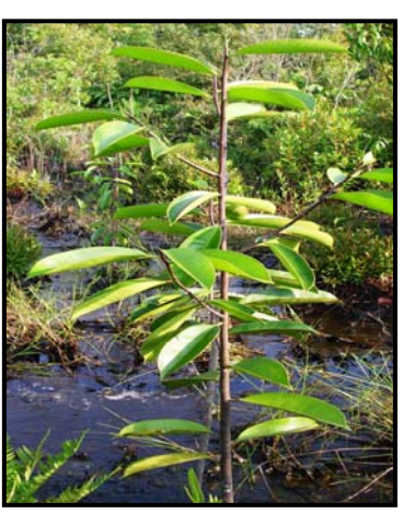
Young sapling of Gonystylus bancanus in South Sumatara, Indonesia.