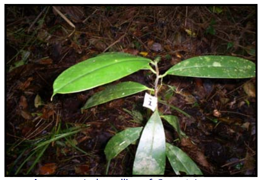
A regenerated seedling of Gonystylus bancanus in Asia.