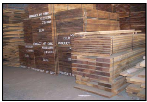
Mahogany sawnwood in Peru.

Project PD 251/03 (cedar component) ended its activities in March 2009. Currently, all information obtained is in the processing stage. One of the results is the identification of dendrological samples of different species found, the analysis of soil and organic matter were carried out to provide a description of the habitat of cedar species and its accompanying species. The analysis of form and volume served to determine the form factor (which expresses how close the shape of the tree trunk is to a true cylinder) at the national level, which is 0.6822, as well as the volume tables for this tree species. A map of the probability of existence for cedar species was also prepared, from which the population of the genus Cedrela has been estimated in the country as being between 1 million and 1,154,000 individuals; 62.12% of the population is below the minimum cutting diameter (DMC) and 37.88% are commercial trees. The final report of this Project will be presented in approximately one month.