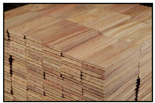
Mahogany sawnwood in Peru.

ITTO will undertake a mid-term evaluation of program progress in the second half of 2009. The EC may also undertake a follow-up monitoring mission which may include visits to Latin America and Africa. The optimal time to visit field activities in Brazil would be from August-October when the field crews will be in camp. Since there are currently three activities underway and another about to start, the visits will be combined and coordinated to ensure the best season to conduct field visits. In addition to external monitoring, the regional coordinators undertake on-going real time monitoring of all activities, including receiving and assessing monthly reports from implementing agencies and undertaking at least one visit to each activity site every 6 months.