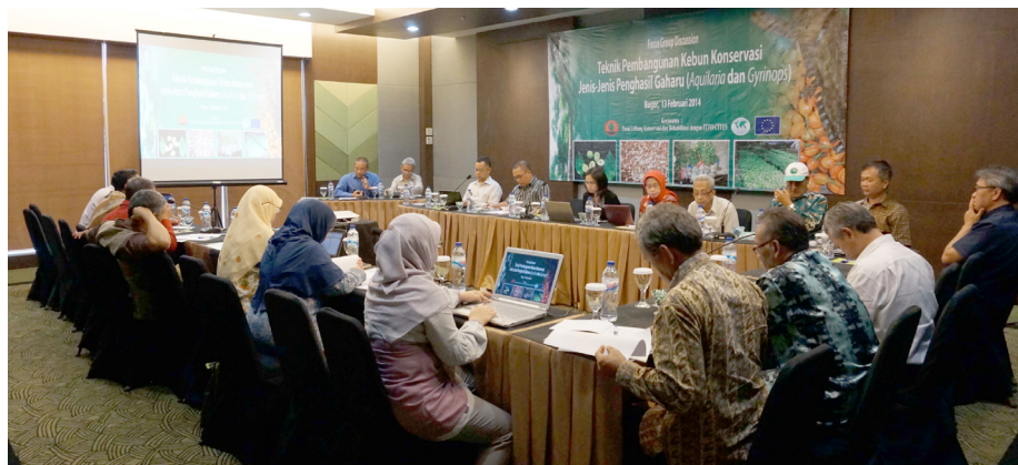
Focus Group Discussion (FGD) on techniques for development of conservation gardens of Aquilaria and Gyrinops species, Bogor, Indonesia, 13 February 2014.

From February to March 2014, collection of seeds and seedlings as well as the assessment of the taxonomical and population status of Aquilaria and Gyrinops through examination of herbarium collection and identification of the species had continued in West Nusa Tenggara and South Sulawesi. In this regard, a nursery was established to cultivate and maintain the seeds and seedlings that have been collected. A discussion among the stakeholders on "Agarwood in situ and ex situ conservation status, location, potency and management status" was conducted on 20 February 2014, while the collection of data and information on in situ and ex situ conservation of both the species was carried out in South Sumatra, Bangka Belitung and Bengkulu Provinces in March 2014.