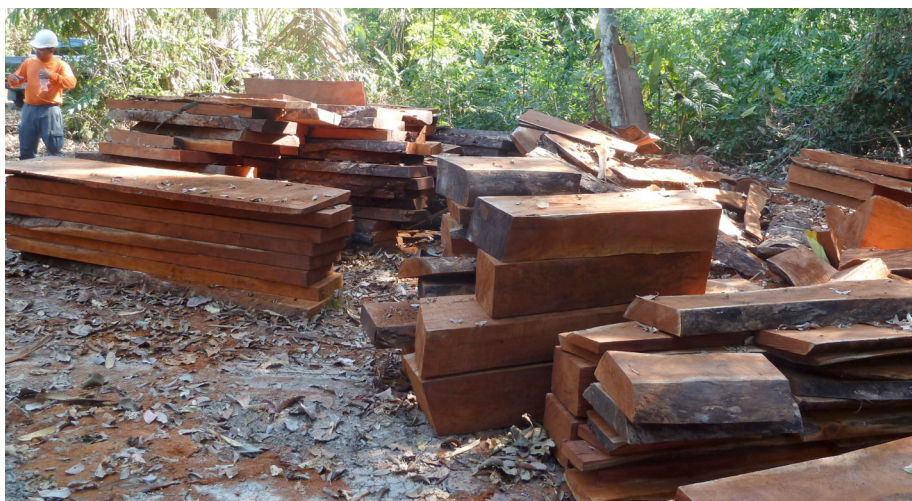
Use of tree branches, stumps, and buttress of a mahogany tree in Fazenda Seringal Novo Macapá, Acre state, Brazil.

Yield Model to local conditions in South and Central America. Workshop materials will emphasize using data from local populations to project population dynamics and sawn timber production over multiple cutting cycles. The model was presented at the Forest Management & Monitoring Stakeholder Forum held from 20-21 March 2014 at the University of Belize in Belmopan, Belize.