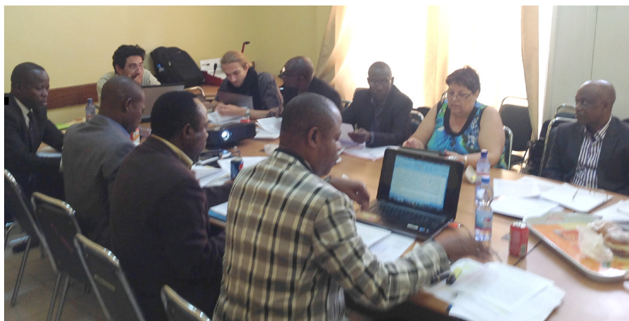
Meeting of the Ad-hoc Technical Committee to analyze reports of experts and draft the NDF report on P. elata in DRC, April 2014.

The Activity commenced implementation in October 2013 and is expected to be completed in September 2014. It aims to collect data on the status of Pericopsis elata in the forest concessions of the Democratic Republic of Congo (DRC). It will include data on phenology, health and stocking, as well as current harvest rates and information on sound silvicultural practices of the species. At the completion of the Activity, the expected outputs are (i) status report on the production, processing, and trade in P. elata in DRC; (ii) status and stocking of P. elata in forest concessions; (iii) harvest rate, as well as sustainable export quota; (iv) information on the biology, ecology and the minimum