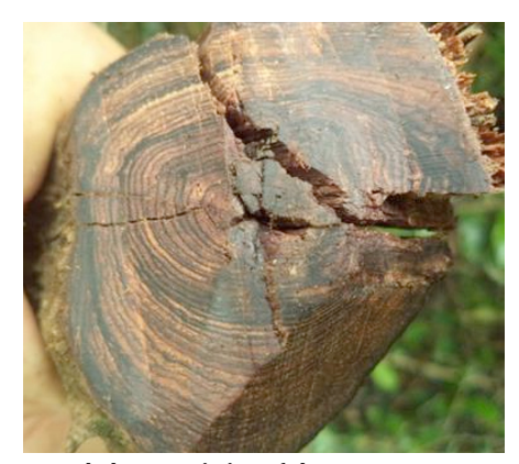
Wood characteristics of the genus Dalbergia .

According to initial indicators of the genus Dalbergia , the species has been found in areas with specific characteristics, such as totally flat areas, areas with possibility of flooding during the rainy season, forest with an average height of 15 m, and forest with 60% light incidence in its understory. Dalbergia species are associated with other tree species such as Lucida gymnanthes , Bursera simaruba , Metopium brownei , Sebastiana longicuspis , Protium copal ,