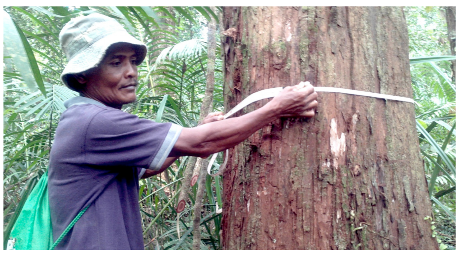
Field verification of ramin distribution involving local people.

The Activity is expected to be completed in March 2015. The main objective of the Activity is to develop a web-based information system of ramin and karas in Malaysia for management and conservation purposes (MyCITES). The expected outputs of the Activity are information on (i) ramin and karas distributions in Malaysia; (ii) research and development of ramin and karas in Malaysia; (iii) timber trade and production of