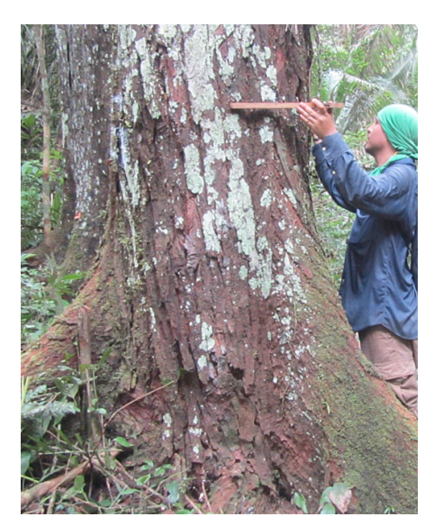
Measurement of mahogany tree diameter at breast height (dbh) at Maderyja Forest Concession, Tahuamanu, Madre de Dios, Peru.

In the first field study, the Activity team collected information from 58 mahogany and 163 cedar trees, comprising seed trees and commercial trees, whereas in the second field study the team collected information on 129 mahogany and 87 cedar trees. In total, 437 mahogany and cedar trees were evaluated. The information was used to make the necessary adjustments to the tree sampling design for the evaluation of forest census and to have preliminary information to determine the acceptable ranges for evaluation of quantitative variables. See the