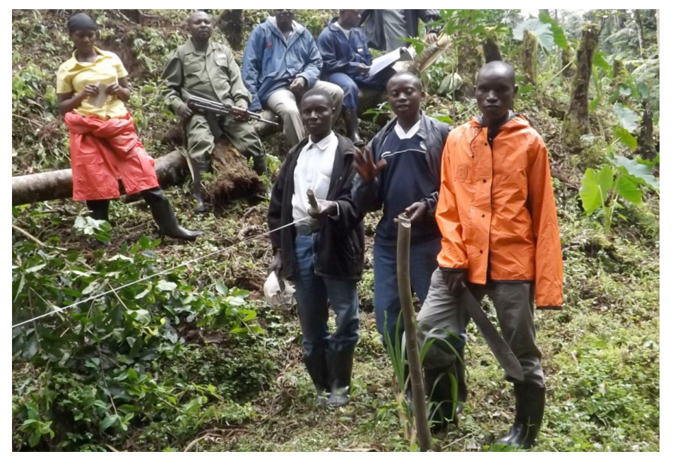
Training of field technicians in conducting Prunus inventories in the Kalikuku Forest Reserve, Butembo, DRC, May 2014.