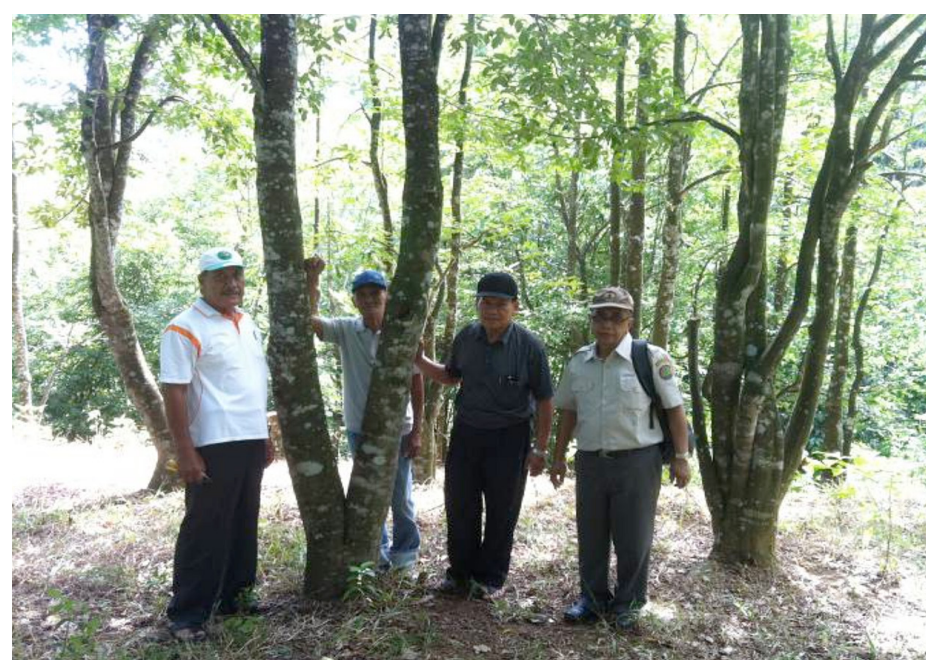
Agarwood plantation with diameter > 20 cm, ready to be inoculated in Bohorok, North Sumatra, Indonesia.

South Kalimantan ad West Nusa Tenggara. Interviews and discussion with involved stakeholders were also conducted. A report on "In situ and ex situ conservation of Aquilaria and Gyrinops : A Review" has been prepared.