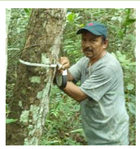
Measurement of a Dalbergia tree, Guatemala.

Jatropha curcas, Guettarda combsii, Aspidosperma cruentum, Swietenia macrophylla, etc; and with forest having on average 12 trees ≥ 25 cm dbh/ha, average height of 13 m, and with little natural regeneration. In addition, the species does not exhibit any phenological patterns in terms of flowering frequency.