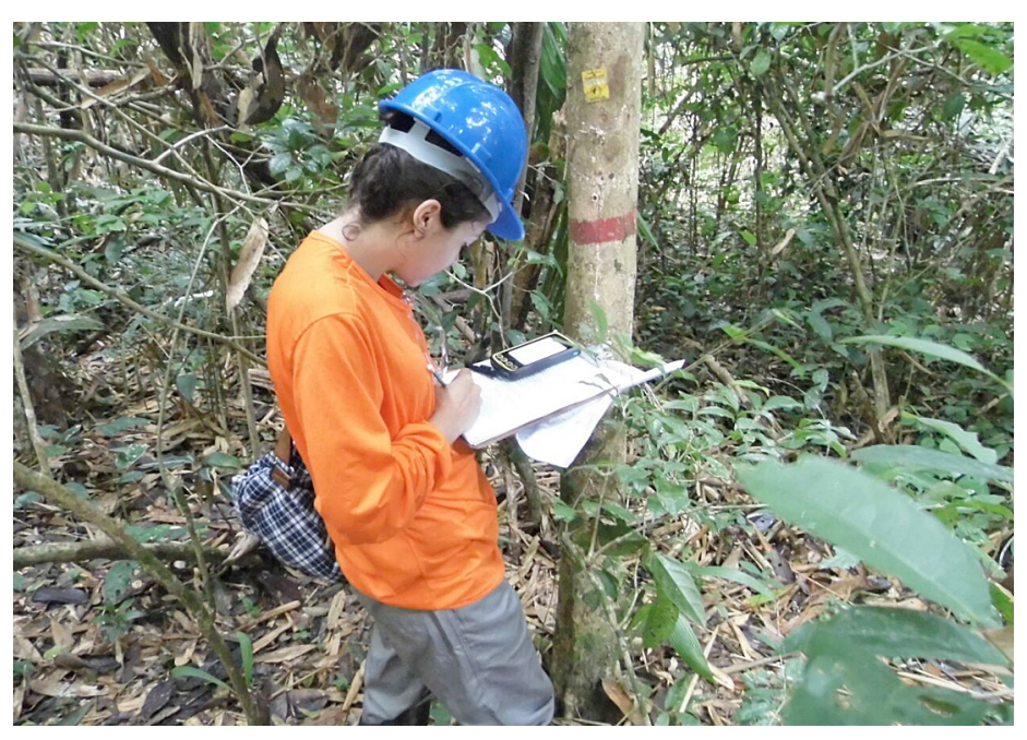
A M.Sc. student measuring a permanent sample plot at the Fazenda Seringal Novo Macapá, Acre state, Brazil, August 2014.

The expected outputs are to produce (i) 200 copies of field-tested manual for the identification of Aquilaria to species level in Peninsular Malaysia; (ii) 200 copies of field-tested manual for the grading of agarwood to be used by the staff of FDPM; and (iii) 30 persons from FDPM trained as trainers and who are proficient in the identification of