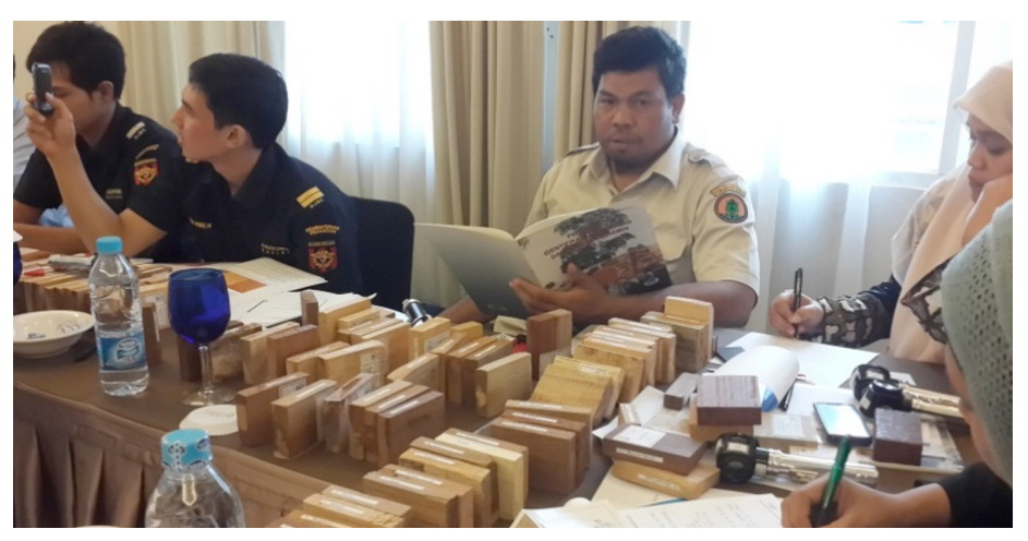
Identification of ramin and ramin looked-alike specimen at the Training Workshop held in Bogor, Indonesia, 13-15 April 2014.

The Activity has revised its effective implementation period and is now expected to be completed in December 2014. It aims to contribute to the sound management of