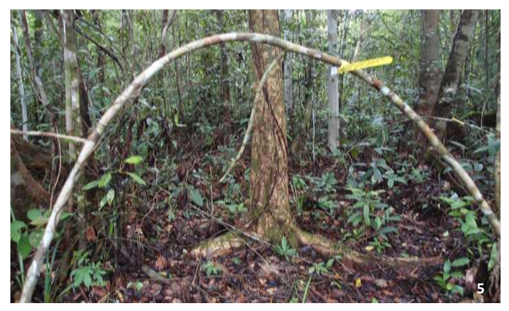
Figure 5 Bending of a sapling in Lingga, Sri Aman