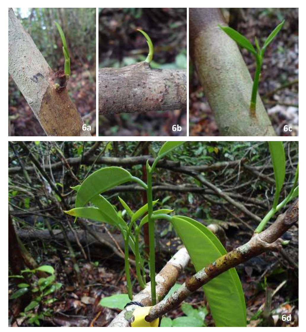
Figure 6 Epicormic shoots induced from the bent saplings in the field