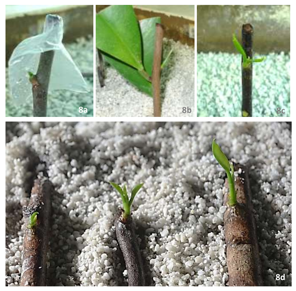
Figure 8 Axillary shoots induced from both the thin and thick cuttings