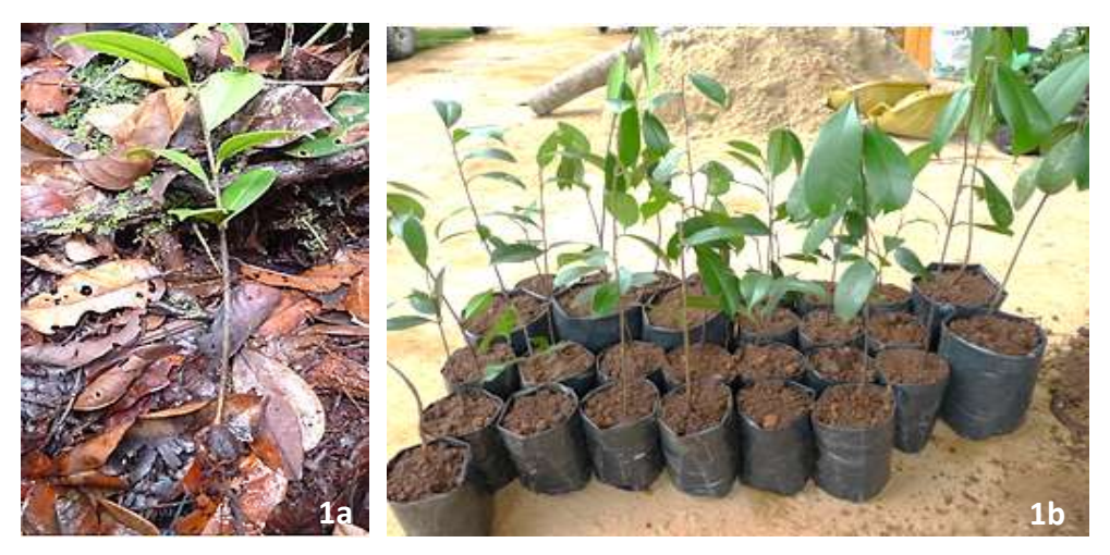
Figure 1 Wildings collected from Lingga, Sri Aman and Loagan Bunut National Park, Miri were potted and kept in the nursery for hardening for two months

Ramin wildings were collected from two different locations in Sarawak, i.e. Lingga, Sri Aman and Loagan Bunut National Park, Miri. The collected wildings were initially kept in the nursery for hardening (Figure 1). A trial planting of ten wildings was initiated in the hedge orchard, however the growth rate was very slow (Figure 2). Bending was carried out on these planted wildings after three months of planting for rejuvenation purpose but they failed to produce epicormic shoots (Figure 3). One of the factors contributing to the failure was the age of the wildings. Wildings collected were young and small in stem size. Thus, the hedge orchard cannot provide adequate explants to be used for this project. On the other hand, the remaining wildings collected were kept in the green house (Figure 4). These wildings were sprayed with 0.2% a.i. Mancozeb once a week. The shoot tips, nodes and leaves of the wildings were pruned to be used as source of explants.