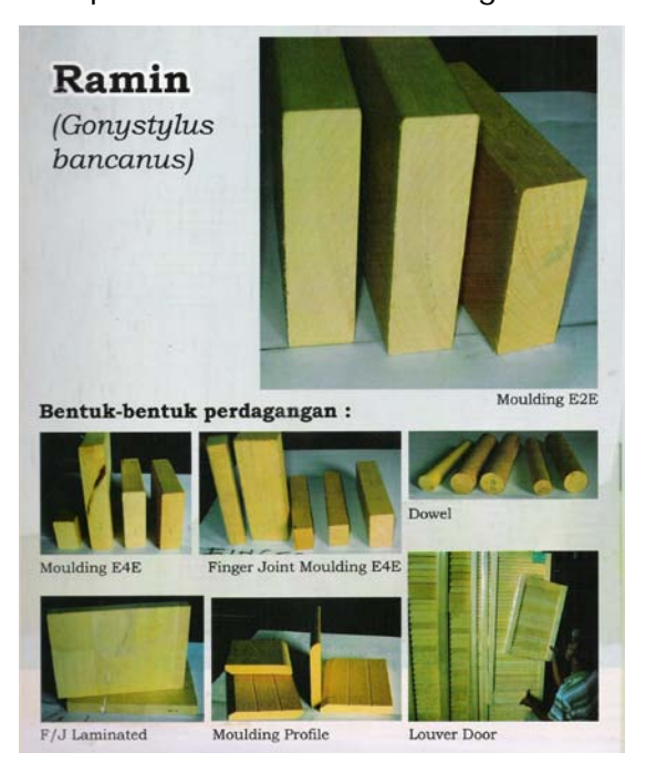
Figure 1. form of Ramin Wood

Wood Ramin exported from Indonesia were mainly in the form of semi-finished products , such as molding, dowel and F / J Laminated. Form of Ramin wood was exported can be seen in Figure 1 below.