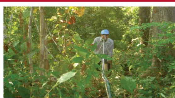
Marked: A forest worker demarcates an experimental plot at the study site.

Forest Research Institute, Myanmar (rosynewin/Ogmail.com)