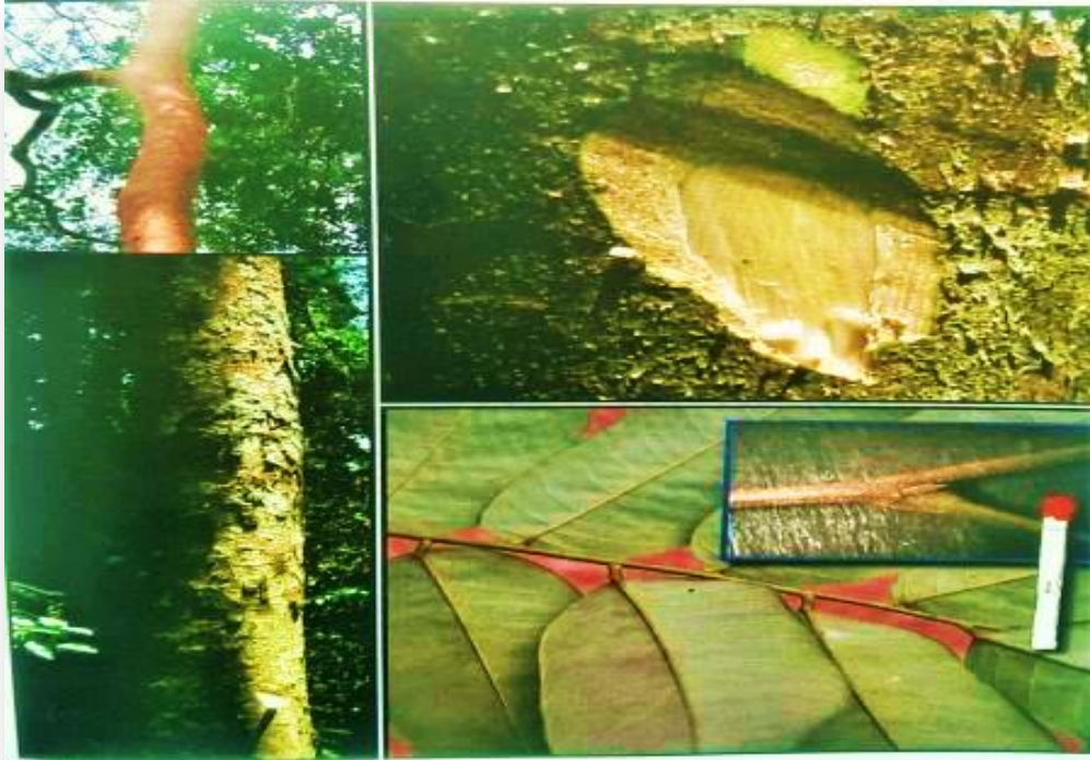
Figure 2: Features of Distemonatus bentamianus (Bonsamdua); picture taken by; Hawthorne, W.D & N. Gyakari 2006 “Photoguide for the forest trees of Ghana”.