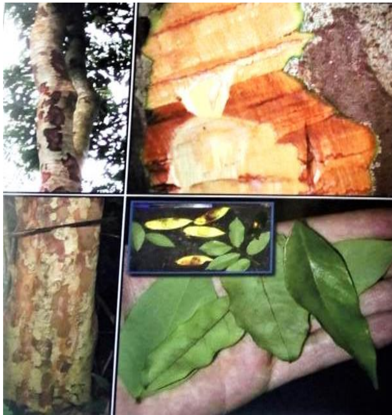
Figure 1: Features of Pericopsis elata , picture taken by; Hawthorne, W.D & N. Gyakari 2006 “Photoguide for the forest trees of Ghana”.