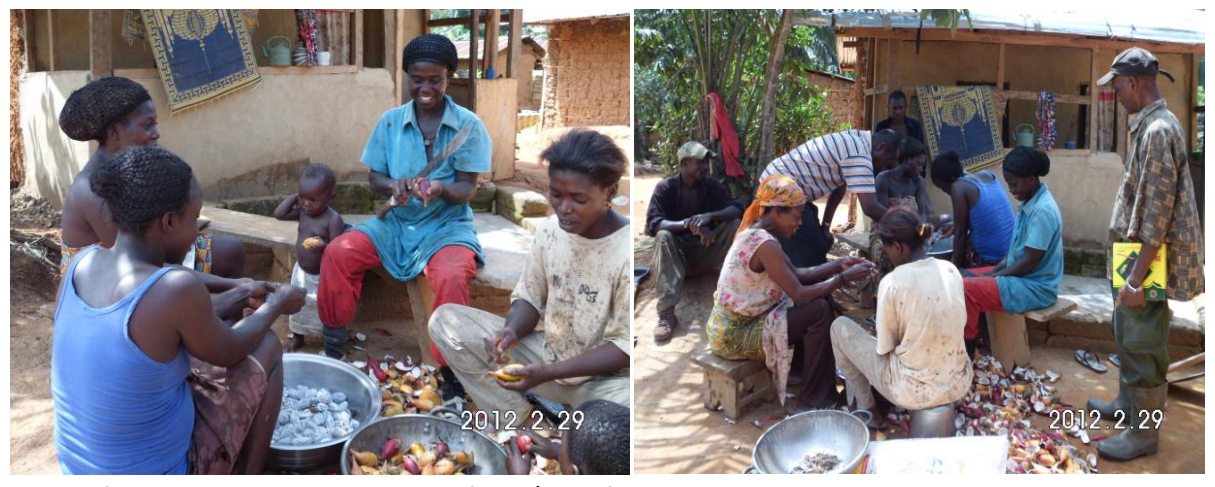
Female farmers split opening the GOP fruits/pods for the seeds

Before the seedlings were transferred to the poly bags, they have raised for some few weeks on the germination beds. The seeds were spread over on the 4 beds. This process is known as broadcasting of the seeds. Watering of the seeds was done twice a day (morning and evening) to enhance early germination of the seeds.