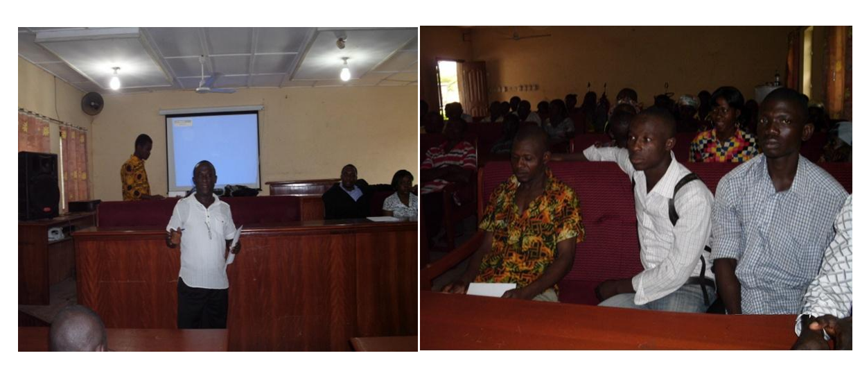
A section of the participants listening to a Resource Person at the training workshop