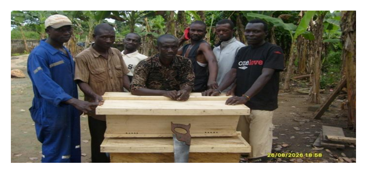
Artisans and the instructor with finished bee-hives