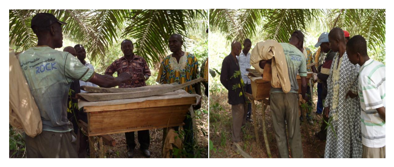
Enterprising Beekeeper Sharing His Experience with Visiting Beekeepers

The general impression of the farmers were that what they have seen and heard from the old farmers, has given them the needed encouragement and motivation to work hard as there is more to achieve in the enterprise.