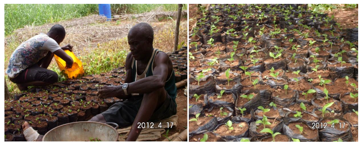
Farmers busily transplanting the germinated seeds on the poly bags at the nursery

The broadcast seeds germinated after 21 days. When they develop 3 or 4 leaves, they were removed from the beds placed in the head pans and transplanted on to the filled poly bags. Before this process, the poly bags were watered.