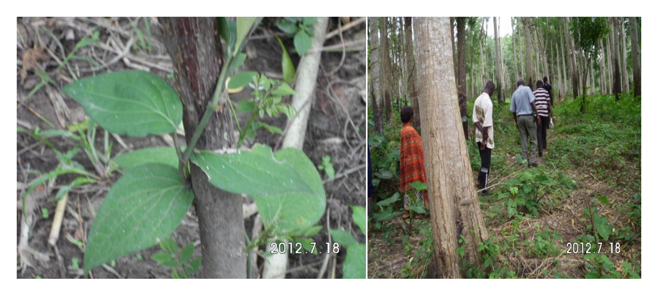
Male - 60% , Female - 40%