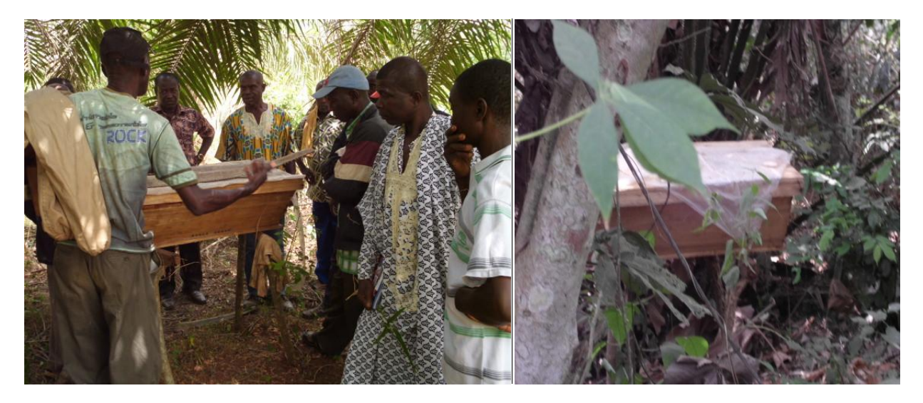
Enterprising Beekeeper Demonstrating Baiting processes to Visiting Beekeepers

advised them on some maintenance culture to undertake and advised them not to lose hope and abandon the non-colonized hives