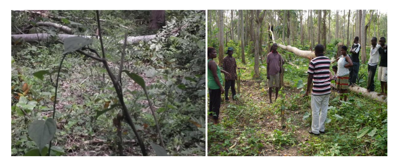
The visiting Black Pepper farmers at one of the farmers' farm