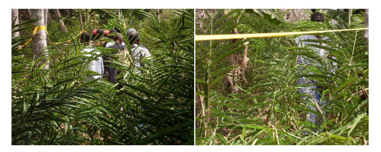
The visiting GOP farmers at the Demonstration farm