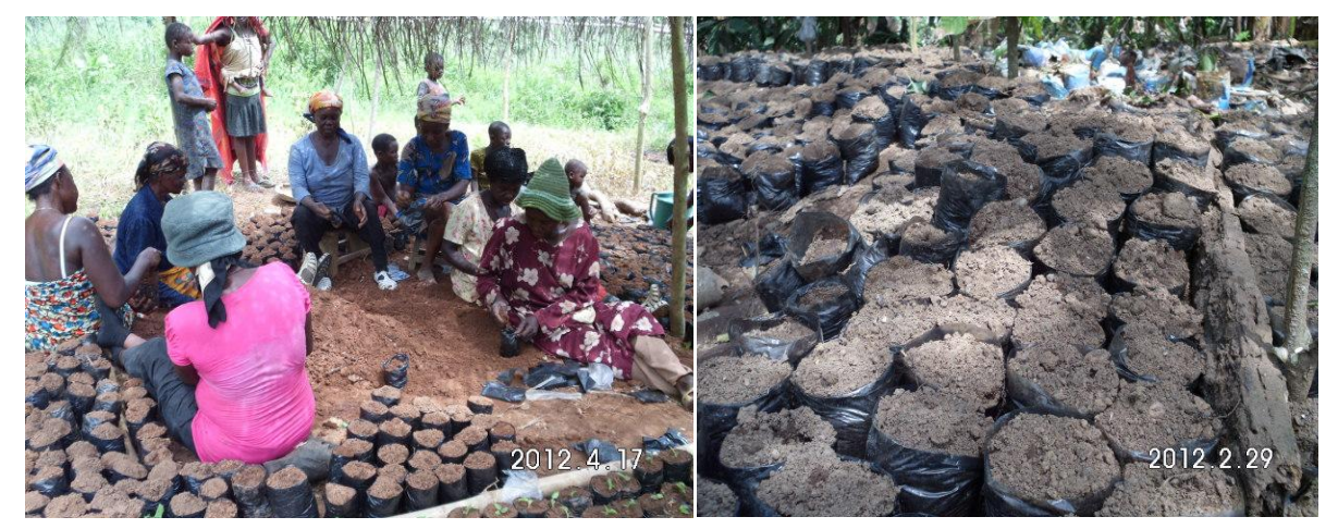
The GOP farmers filling the poly bags with black soil at the nursery

The farmers filled the procured poly bags with black soil whilst the seeds were on the germination beds.