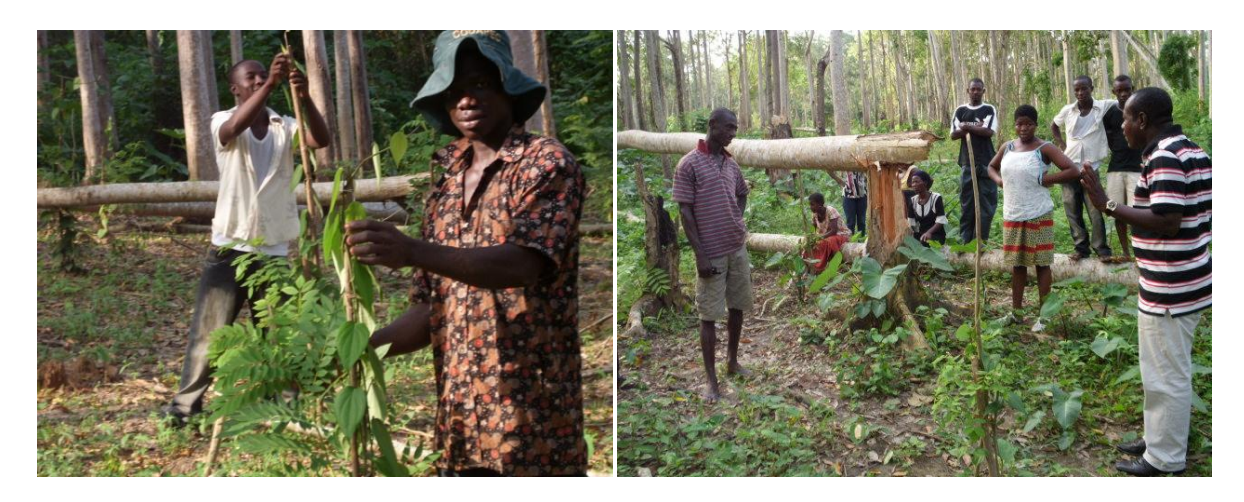
The visiting Black Pepper farmers at one of the farmers' farm

The farmers visited two (2) of the enterprising Black Pepper farmers' farms at Ahantamo. The enterprising farmers took the visiting farmers through their farms. The visiting farmers were very happy to see how they have maintained their farms. They took them through the maintenance practices needed for the growth of Black Pepper. The farmers asked questions ranging from farm maintenance, harvesting, processing, marketing to challenges, problems etc. The farmers also shared their individual experiences on the cultivation of Black Pepper with their counterparts at Ahantamo.