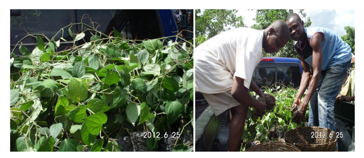
The breakdown is as follows:

Four thousand (4000) seedlings of BP were distributed to forty (40) farmers in three (3) communities of Nyamebekyere, Awadua and Nyinanufu for planting during the month under review. Each of the farmers planted half an acre with 100 seedlings.