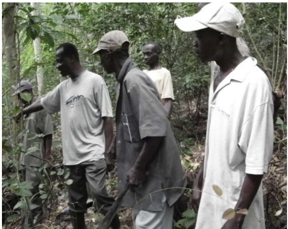
He advised them to do the following: