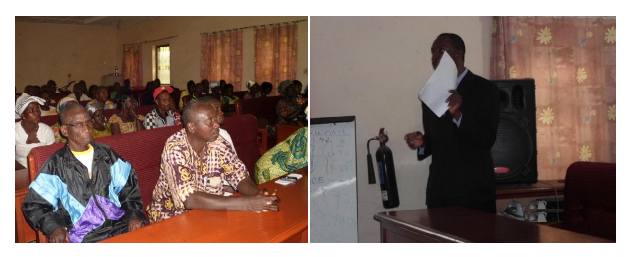
A RESOURCE PERSON MAKING HIS PRESENTATION TO THE PARTICIPANTS AT THE WORKSHOP

He took the participants through the rudiments of group formation/cooperatives.