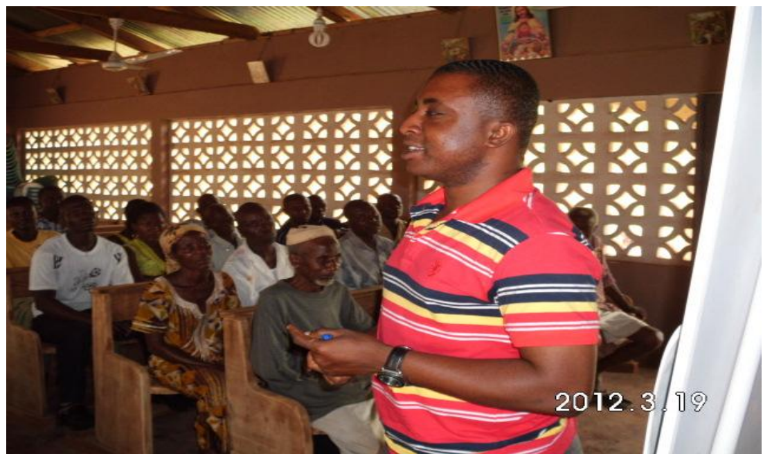
Resource person making his presentation.

The participants were taken through the following topics: