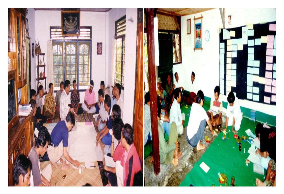
Figure 1. Collaborative mapping process of NTFP development needs in the area of Aiberik village, Central Lombok