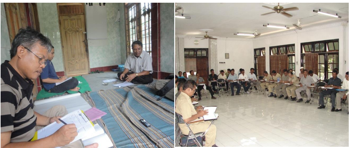
Figure 3. The process of gathering requirements for capacity building with government in Central Lombok District