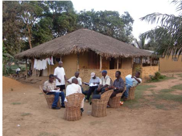
Figure3. Data analysis at Yarpa Township