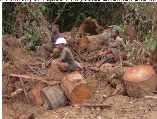
Figure3. Forest workers at EJ&J FMU.