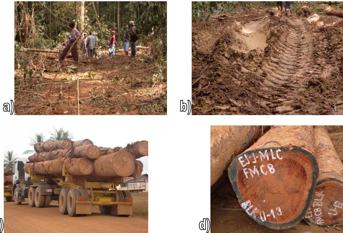
Figure2. Some aspects tested on the field: a): Felling techniques impacts; b): Impacts on soils; c) & d): CoC.