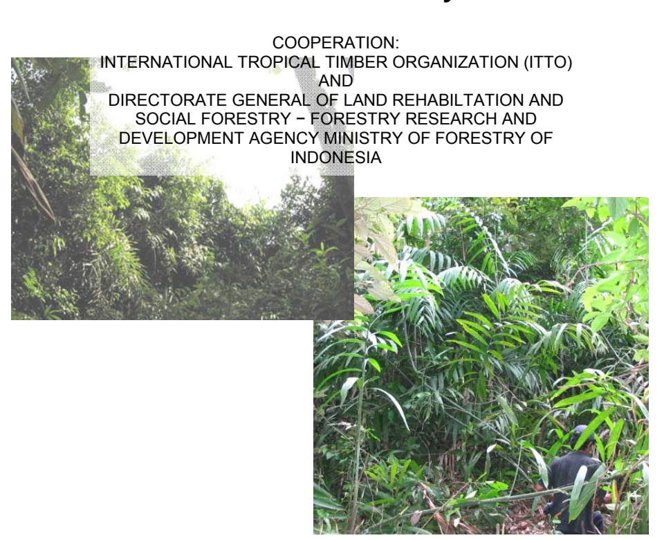
Jakarta, February 2008