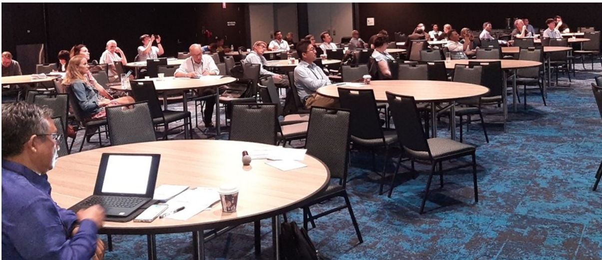
A view of audience in teak partner event

The 5- day conference concluded with an optional post-conference tour on Friday, 9 th June to ride on the Skyrail to the Kuranda, flying above the world’s oldest tropical rainforest, and to the Walkamin Research Station, to see first-hand 20 years of research trials. The IUFRO All Division 5 conference was attended by over 300 participants from 26 countries.