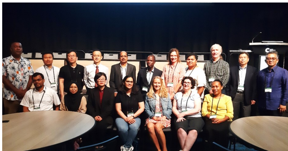
Participants and organizers of Partner Event on Teak

A Side Event hosted by the IUFRO Teakwood Working Party, ITTO and Teaknet examines challenges and opportunities for boosting teak value chain