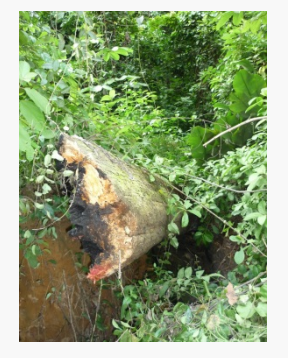
Document ITTC(LVI)/4 Rev.1