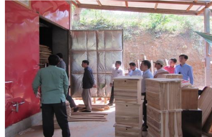
Wood processing in Kok Ngiew Group

In 2011 the program obtained a FSC group certificate, which is the first smallholder plantation certification within Lao PDR. Over the past five years, Luang Prabang Teak Program (LPTP) has used FSC as a guideline to improve forest management and FSC has been an important mechanism for the development of the program. Some of the benefits from the establishment of the group include capacity building, establishment of small scale enterprises, clarifying land tenure and strengthening farmers' negotiation power.