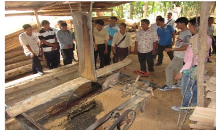
Ban Xieng Lom Processing group