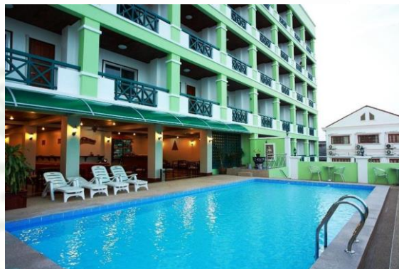
Vansana Riverside hotel in Vientiane