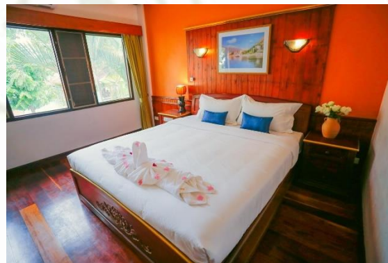
E-outfitting Vang Thong Hotel in Luang Prabang.