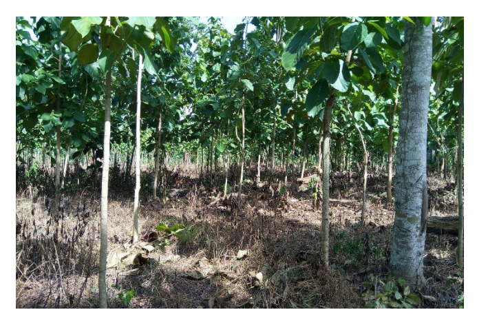
Forest rehabilitated by Women