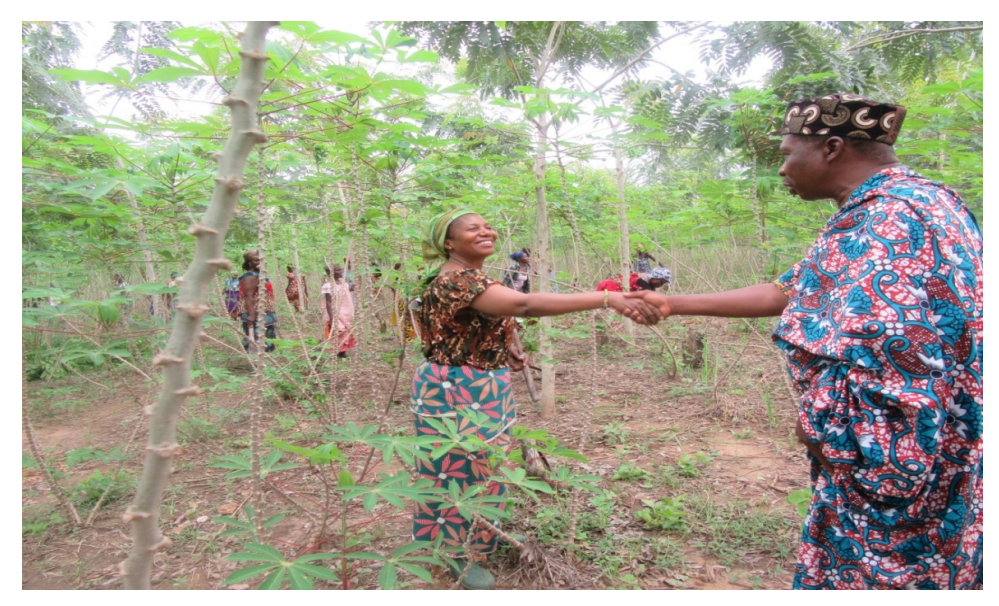
Local traditional Chief visiting women's plantation