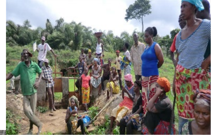
Women's tree nursery