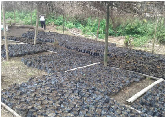
Women's tree nursery