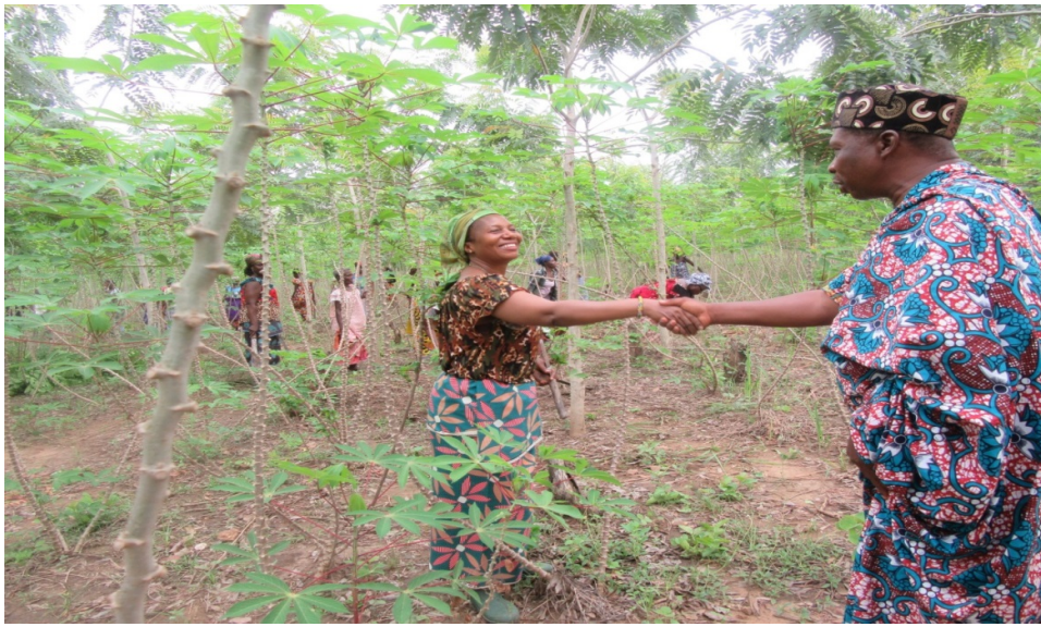
Local traditional Chief visiting women's plantation