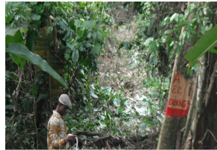
Resources Inventory in a Community Forest