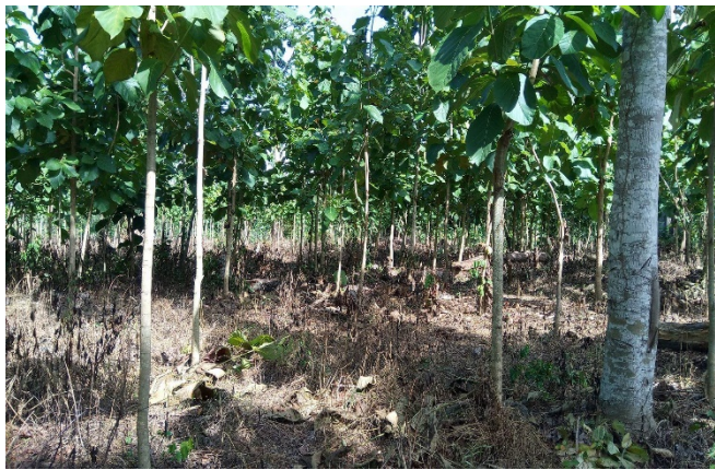
Forest rehabilitated by Women