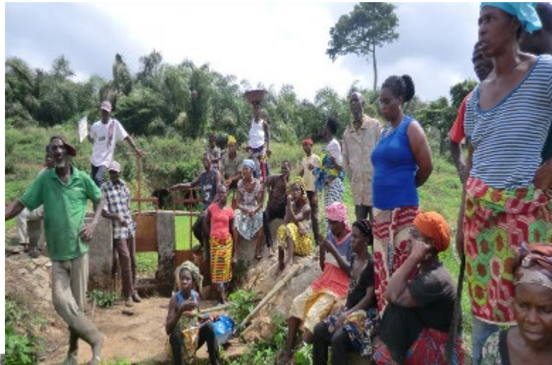
Mangrove nursery established by Women