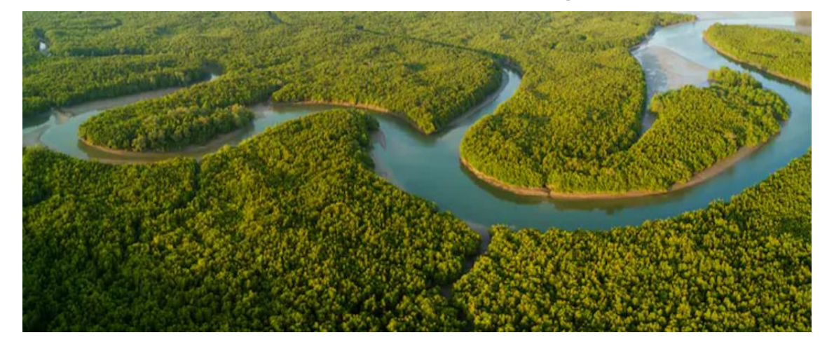
Mangrove protected area