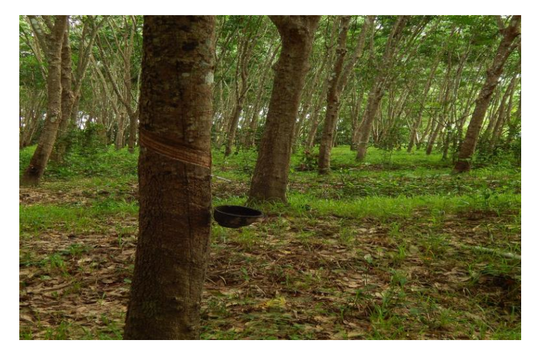
Pine Mangrove Para rubber

Total Area 48 million rai (currently only 26 million rai)