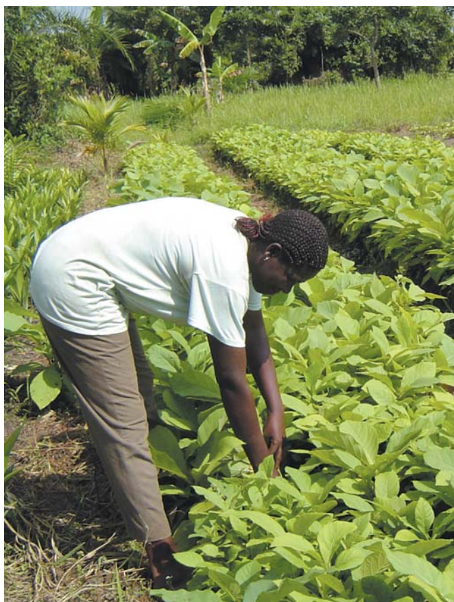
A nursery established by a group of women to help rehabilitate degraded forest lands in the Volta Region.

THROUGH 30 YEARS OF EXPERIENCE, ITTO HAS DEVELOPED INNOVATIVE AND EFFECTIVE METHODS FOR CAPACITY BUILDING, AND DISSEMINATED CRITICAL TECHNICAL INFORMATION AND LESSONS LEARNED ON THE DEVELOPMENT OF COMMUNITY FOREST ENTERPRISES (CFEs).