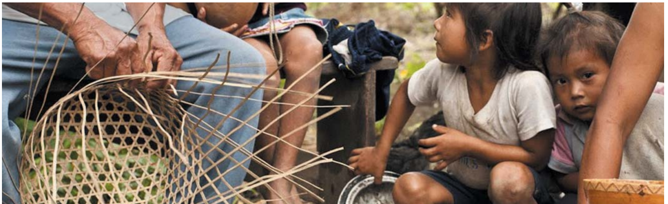
The Shuar people of Ecuador.