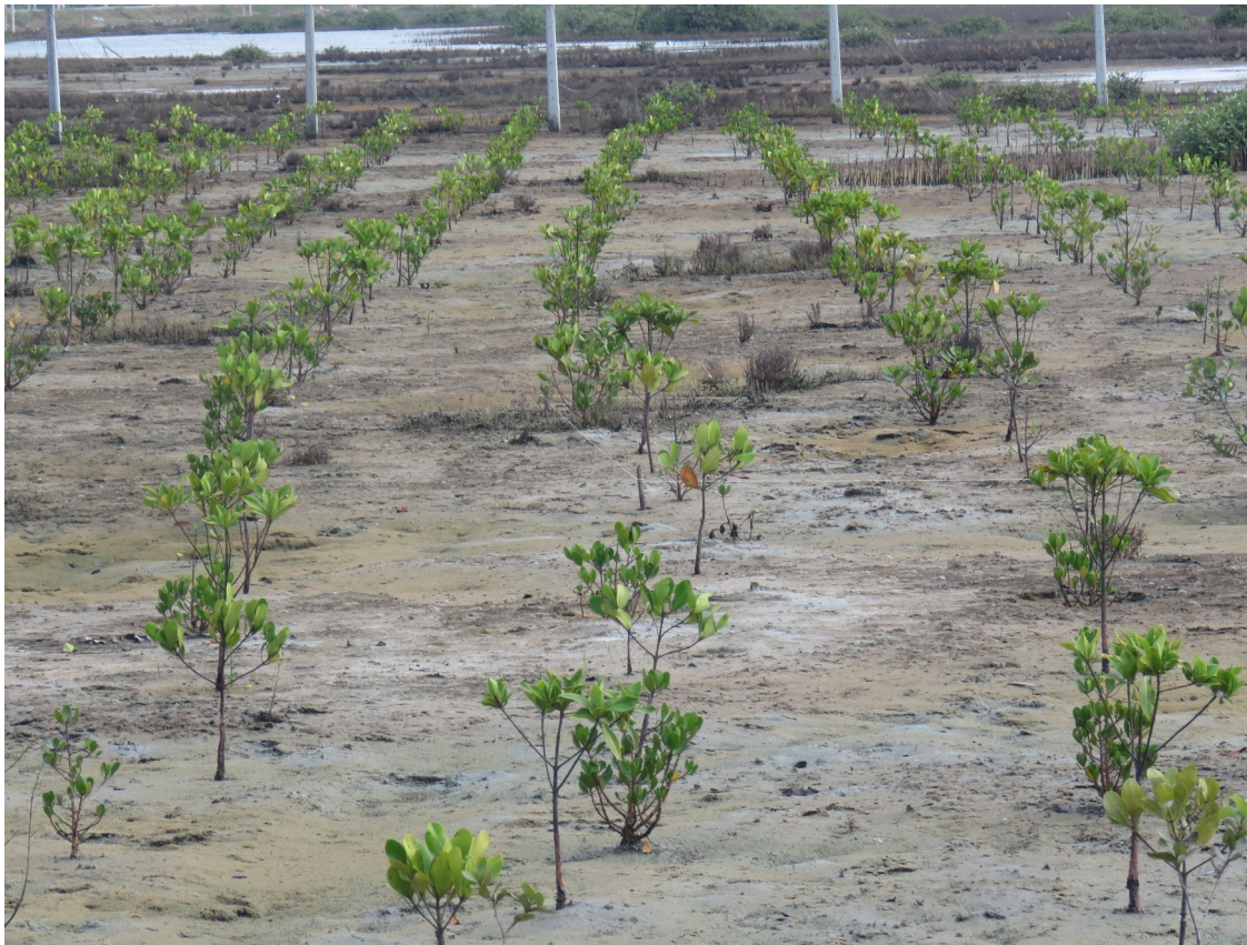
Planted in January 2015

with the Seacology financial support, Sudeesa has launched a mangrove conservation drive with the communities throughout the coastal belt of Sri Lanka