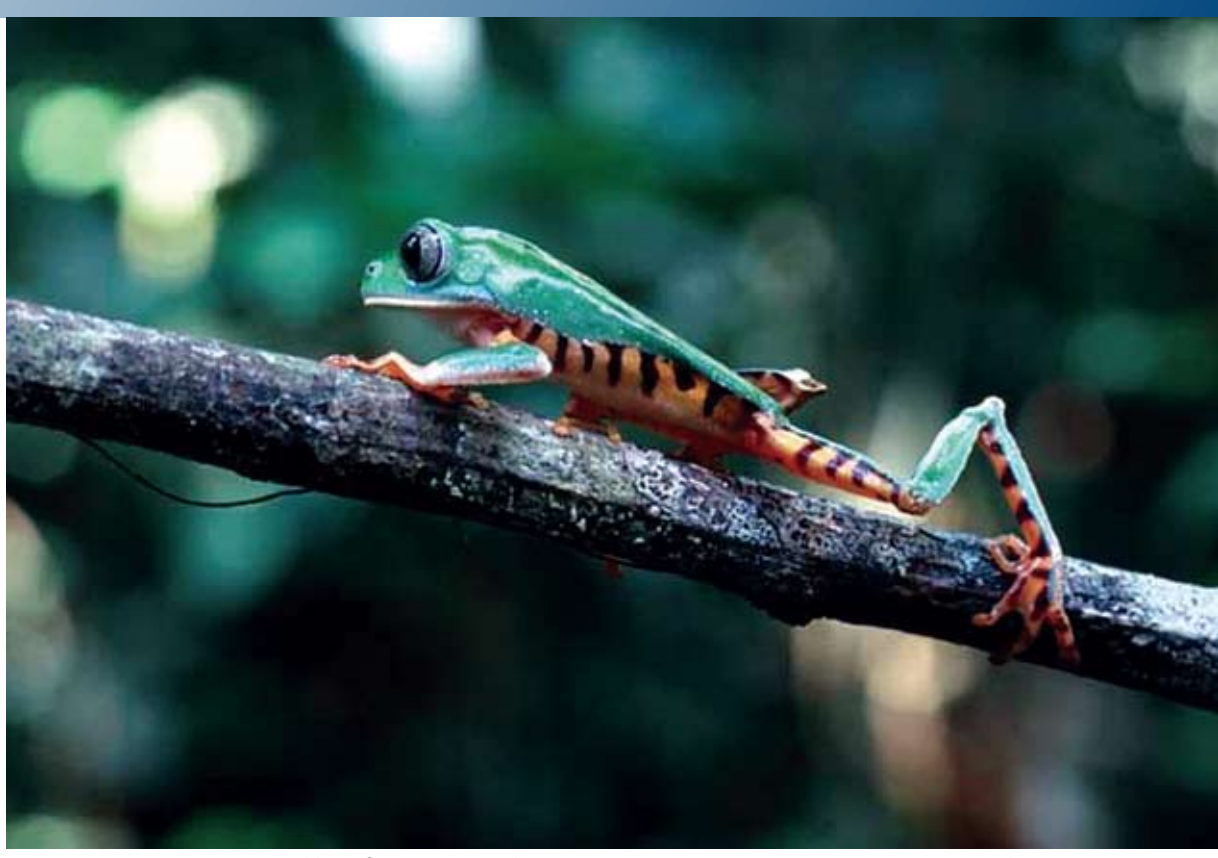
Needs protecting: The splendid leaf frog ( Cruziohyla calcarifer ), like other tropical amphibians, is endangered by loss of habitat, environmental change and disease.

Forest Conservation Programme IUCN – International Union for Conservation of Nature agni.boedhihartono@iucn.org