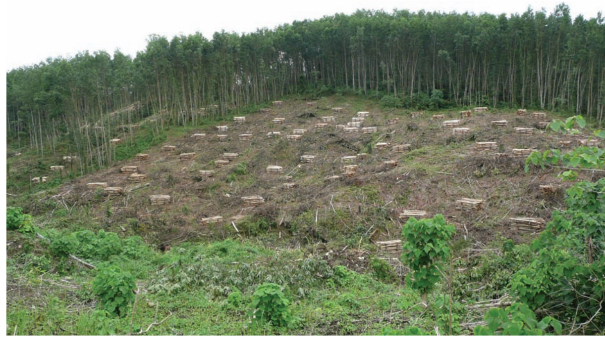
Wood crop: Plantations are an increasingly important source of industrial raw materials, including in the tropics.

The global demand for wood is expected to escalate in coming decades, yet current rates of establishment of new forest plantations are inadequate to meet this demand. This article looks at projected wood demand, expected growth in the plantation sector, and the measures that might be required to stimulate growth among small and medium-sized forest-growers and to ensure that the sector is economically, socially and environmentally sustainable.