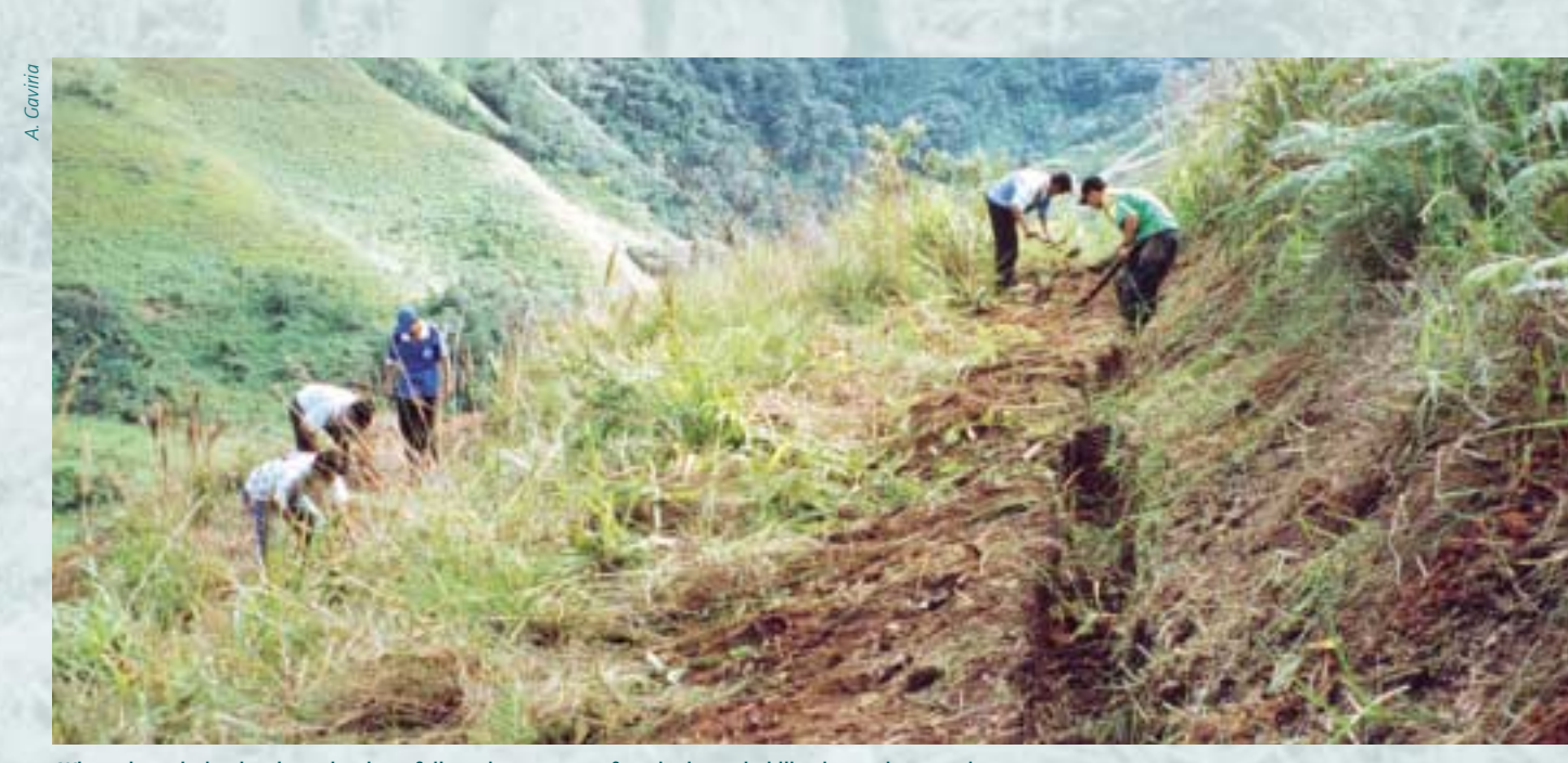
Where degradation has brought about failures in ecosystem functioning, rehabilitation and restoration activities should be targeted along riparian strips, steep slopes, field boundaries, and so on.

Section II: Stand-level principles and recommended actions: in this section, 18 principles and 55 actions are listed under a specific objective concerned with the restoration of degraded forests, the management of secondary forests and the rehabilitation of degraded forest lands at the site level. It is particularly directed to: civil-society, private and communal extension agencies; forest practitioners working at a site level; and education, training and research institutions.