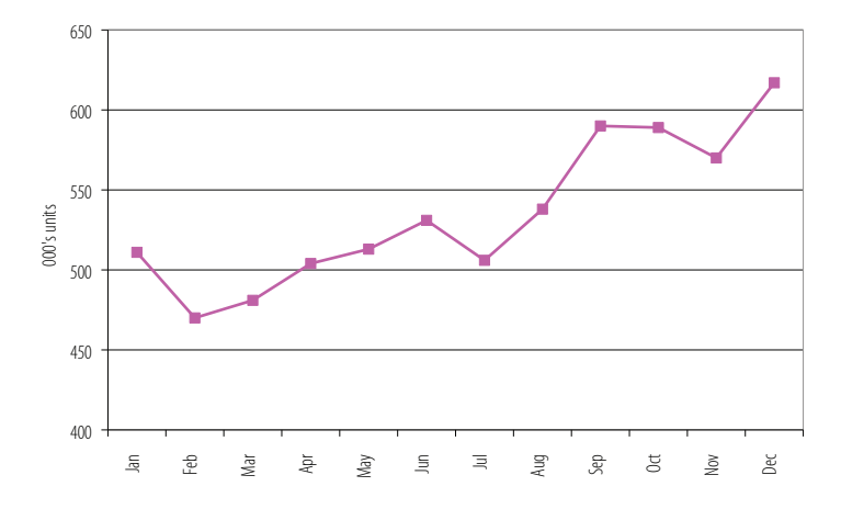
Figure 2. 2012 US monthly housing starts*

* single family units, approximately 70% of total units