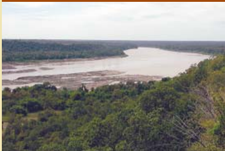
The Mekong River winds its way through the PPFC in northeastern Thailand

The management of the Pha Taem Protected Forests Complex (PPFC) in northeastern Thailand , which covers an area of about 174 000 hectares and comprises four protected areas, is being strengthened by an ITTO project. The project area is situated in a triangle between Thailand, Laos and Cambodia and is drained by the Mekong River. The three countries have agreed to improve conservation cooperation and Cambodia has also requested an ITTO project to assist its efforts. The Complex has some special protection needs that require close cross-border cooperation – in particular, rare wildlife in the PPFC is experiencing increased pressure due to cross-border poaching and trade in plants and animals. Also, many of these areas are scattered with land-mines: eliminating these in the context of the TBCA would remove the risks to local communities and give them a strong reason to support the TBCA.