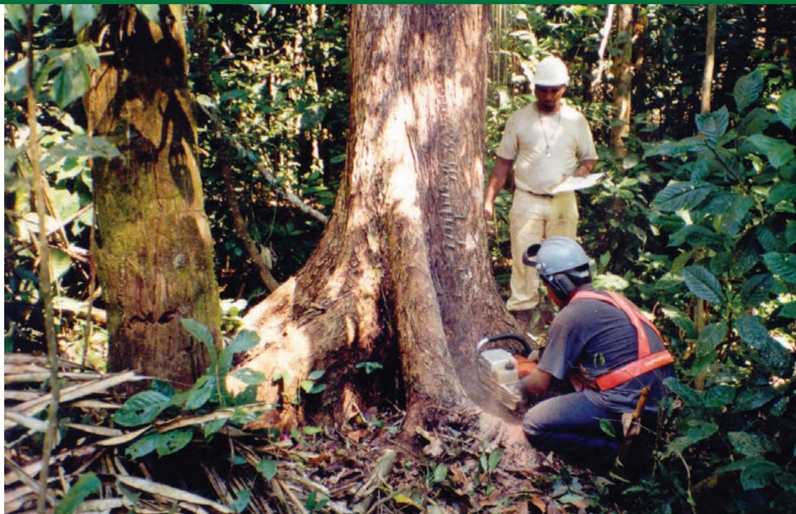
Timber: Reduced impact logging of mahogany at Acre field site.

4 Middlebury College, Middlebury, VT, USA (rlandis@middlebury.edu)