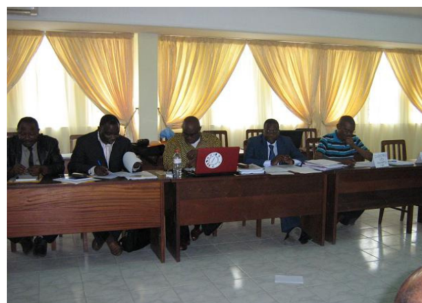
National workshop for the validation of the non detriment findings report on Pericopsis elata (Afrormosia) in Congo, Brazzaville, 26 March 2011.

The national workshop for the validation of studies was held on March 26, 2011 in Brazzaville. A total of 21 participants from the forest administration, the ministry of scientific research and higher education, the research institutions, and national NGOs attended that workshop. The NDF report was validated and the Congo's CITES management authority will send it soon to the CITES Secretariat.