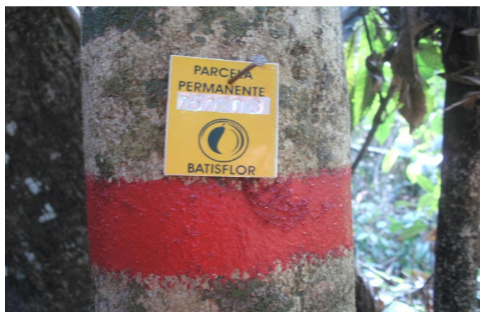
Tree identified with an aluminum tag in permanent sample plots, at Novo Macapa Forest Management Unit, Acre, Brazil.

Partial results of the project were presented at the workshop held in Brasilia from 15 to 17 February 2011 (III Latin-American Workshop of the ITTO-CITES Program).