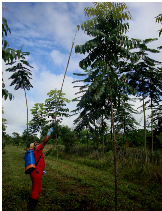
Application of Colacid spray for mahogany (5m high) drill insect control, in Aurora do Pará, Brazil.

The results are very encouraging for the development of mahogany reforestation in the Amazon and southeastern Brazil. In this regard, the coordinators of the project suggest that the ITTO-CITES Program continue encouraging and supporting this research in Brazil in order to give continuity to this promising results, and also to take advantage of mahogany plantations at experimental level already established in the field.