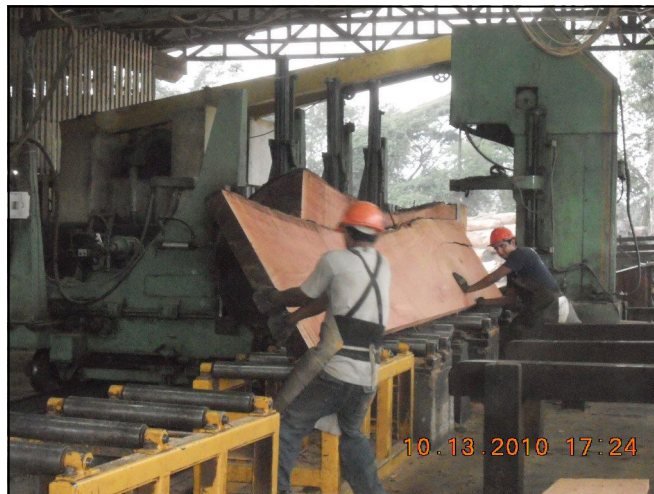
Mahogany sawnwood at a sawmill in Peru

adopted by forest users. The database on cedar and mahogany populations continues to be updated and maintained by professors of the Faculty of Forest Sciences of UNALM.