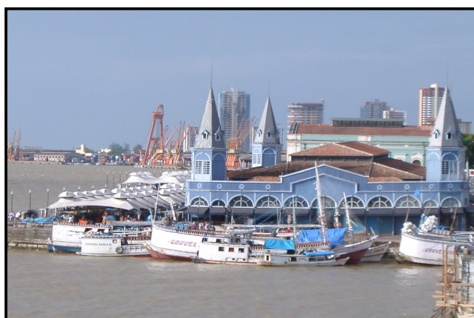
City of Belém, state of Pará, Brazil.