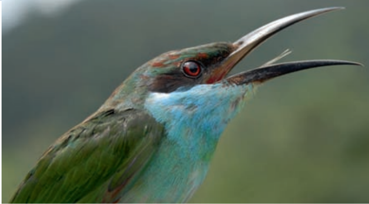
Noisy: Effective TBCAs need stakeholder participation mechanisms that enable all voices to be heard.

Swiss Foundation for Development and International Cooperation Bern, Switzerland