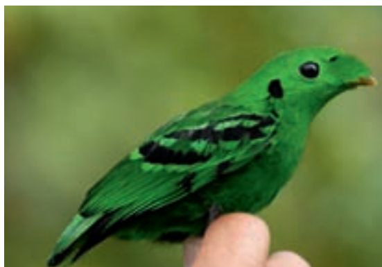
Banded: Green broadbill, captured for banding in the Lanjak-Entimau Wildlife Sanctuary.

Symbols like the inauguration of TBCA initiatives by high-level authorities can provide enduring support. A recent example of such a symbol was the official launching of the joint 'Trans-boundary Peace Park' project in May 2009 by the presidents of Liberia and Sierra Leone (BirdLife International 2009). That single gesture takes the process half-way to success because the rest of the process can follow in the knowledge that there is high-level support.