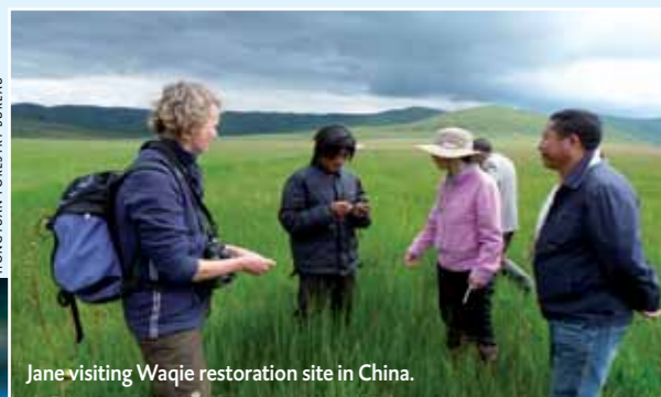
HONGYUAN FORESTRY BUREAU

Maintaining and restoring healthy ecosystems to ensure water availability and other ecosystem services will be essential strategies for long-term food security.