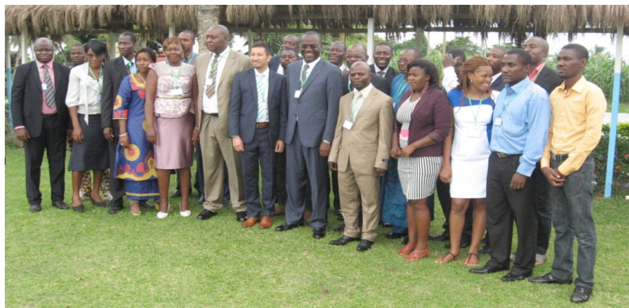
Participants at the training workshop on DNA sampling and extraction of Pericopsis elata , Kribi, Cameroon, 3 June 2014.