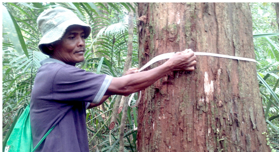
Field verification of ramin distribution involving local people.

To collect information on the reproductive ecology of A. malaccensis , two study sites have been identified in Perak and in the island of Penang where two mother trees were selected for detail study of flowering phenology, flower maturity, anthesis/receptivity and fruit development. Aborted flowers were also collected from seed traps and analyzed.