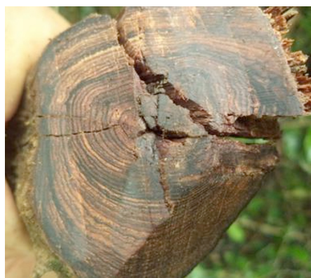
Wood characteristics of the genus Dalbergia .

According to initial indicators of the genus Dalbergia , the species has been found in areas with specific characteristics, such as totally flat areas, areas with possibility of flooding during the rainy season, forest with an average height of 15 m, and forest with 60% light incidence in its understory. Dalbergia species are associated with other tree species such as Lucida gymnanthes , Bursera simaruba , Metopium brownei , Sebastiania longicuspis , Protium copal ,