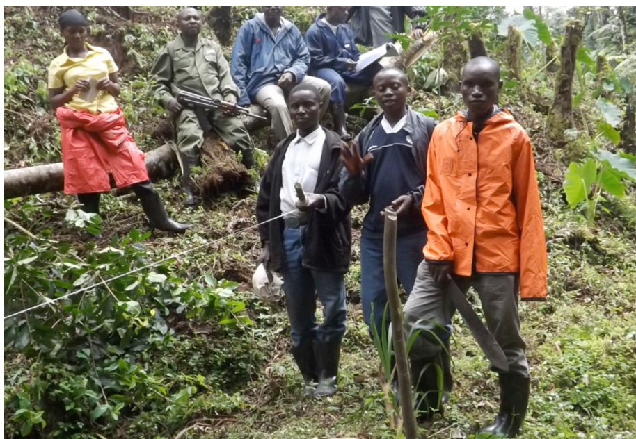
Training of field technicians in conducting Prunus inventories in the Kalikuku Forest Reserve, Butembo, DRC, May 2014.

The ICCN conducted a mission in early February 2014 to strengthen the field work done by "Phusys", the partner of one local trade company ("Maison Kahindo Muvunga"), in the Walikale territory. The ICCN has submitted to ITTO a practical roadmap to complete the Activity as per the monitoring mission of the Regional Coordinator for Africa conducted at the end of 2013. ITTO has disbursed the last instalment of funds that will allow the ICCN to continue to strengthen and monitor the inventories conducted by the trade companies, and to also conduct Prunus inventories in the Kahuzi Biega National Park. The ICCN, the "Centre for the information and promotion of agricultural projects" (CIPAGRI) and the two most important local trade companies organized a second training workshop in Butembo, North Kivu from 25 April-3 May 2014. During the workshop, participants were trained in conducting Prunus inventories. The Regional Coordinator assisted in this training workshop. As a result of the training workshop, CIPAGRI has developed a sampling design for Prunus inventories in the two main areas in the North Kivu, including Mbakira, Masuli and Vusigha, covering a total of 10,000 ha and Kiribata covering 1,700 ha. The Regional