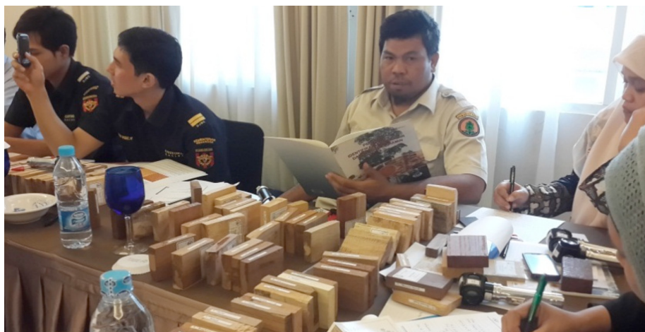
Identification of ramin and ramin looked-alike specimen at the Training Workshop held in Bogor, Indonesia, 13-15 April 2014.

The Activity has revised its effective implementation period and is now expected to be completed in December 2014. It aims to contribute to the sound management of