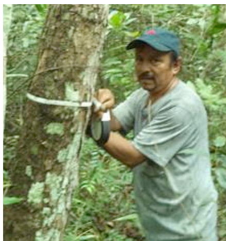
Measurement of a Dalbergia tree, Guatemala.

Jatropha curcas , Guetarda combsii , Aspidosperma cruentum , Swietenia macrophylla , etc; and with forest having on average 12 trees \geq 25 cm dbh/ha, average height of 13 m, and with little natural regeneration. In addition, the species does not exhibit any phenological patterns in terms of flowering frequency.