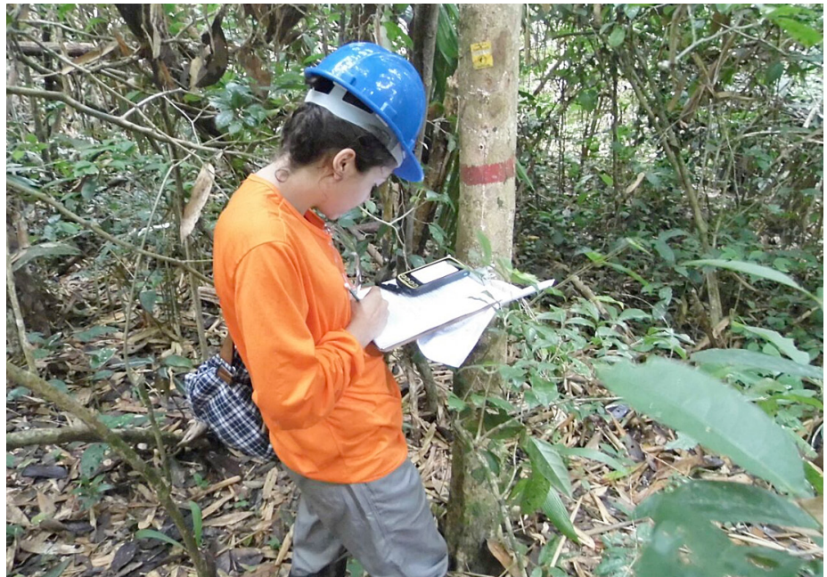
A M.Sc. student measuring a permanent sample plot at the Fazenda Seringal Novo Macapá, Acre state, Brazil, August 2014.

The expected outputs are to produce (i) 200 copies of field-tested manual for the identification of Aquilaria to species level in Peninsular Malaysia; (ii) 200 copies of field-tested manual for the grading of agarwood to be used by the staff of FDPM; and (iii) 30 persons from FDPM trained as trainers and who are proficient in the identification of