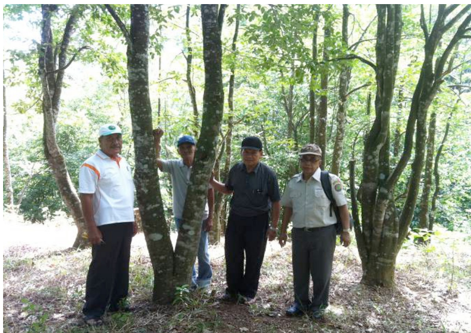
Agarwood plantation with diameter > 20 cm, ready to be inoculated in Bohorok, North Sumatra, Indonesia.

South Kalimantan and West Nusa Tenggara. Interviews and discussion with involved stakeholders were also conducted. A report on "In situ and ex situ conservation of Aquilaria and Gyrinops : A Review" has been prepared.