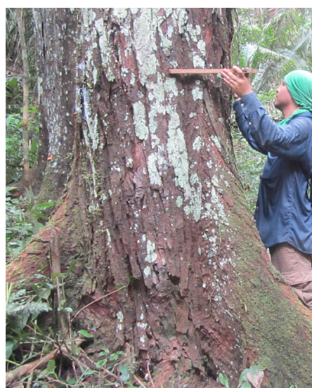
Measurement of mahogany tree diameter at breast height (dbh) at Maderyja Forest Concession, Tahuamanu, Madre de Dios, Peru.

In the first field study, the Activity team collected information from 58 mahogany and 163 cedar trees, comprising seed trees and commercial trees, whereas in the second field study the team collected information on 129 mahogany and 87 cedar trees. In total, 437 mahogany and cedar trees were evaluated. The information was used to make the necessary adjustments to the tree sampling design for the evaluation of forest census and to have preliminary information to determine the acceptable ranges for evaluation of quantitative variables. See the