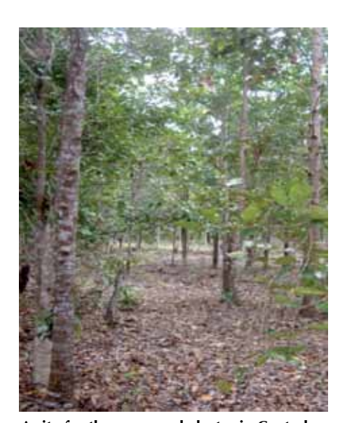
A site for the agarwood cluster in Central Bangka.

Action has also been intiated to identify national experts to undertake a review of the Minister of Forestry Decree No. 127/ KPTS-V/2002 on Temporary Moratorium