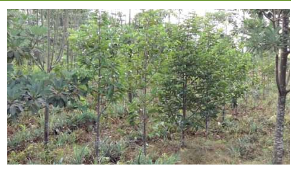
Seedlings of Aquilaria malaccensis being inspected and counted for germination study.

Population survey and sample collection of A. malaccensis had been completed throughout Peninsular Malaysia where 35 populations consisting of 963 samples were used for microsatellite analysis. However, after carefully checking through the microsatellite data, the total number of samples was reduced from 963 to 942 due to dubious genotypes on certain individuals. Microsatellite genotyping on the 942 samples were completed for 12 loci. In this regard, based on the 942 samples collected throughout Peninsular Malaysia and the 12 microsatellite loci, a total of 159 alleles were