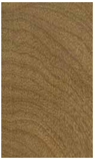
Pau roxo (Peltogyne spp.)