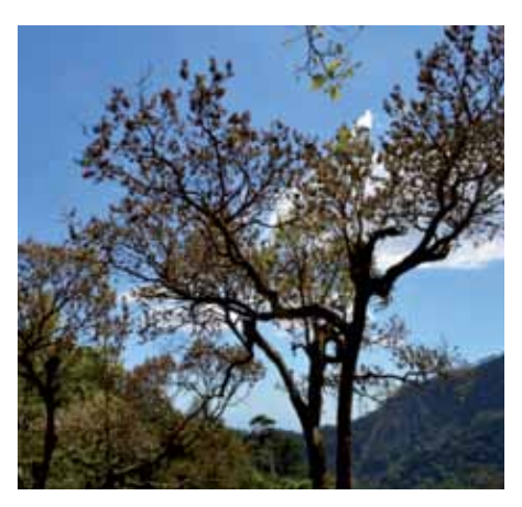
Dalbergia calycina trees in full bloom.

Experts from the following countries and institutions have been invited and agreed to attend the meeting of the Working Group: Brazil, Guatemala, Peru, Mexico, Burundi, Cameroon, Malaysia, Indonesia,