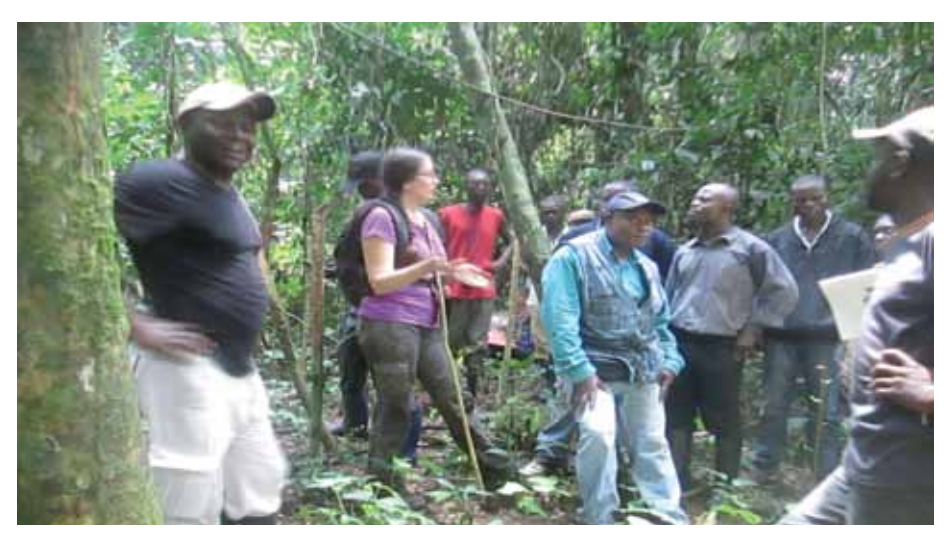
Verification of Pericopsis elata management inventories in the forest concession of Alibuku, Kisangani, DRC, August 2015.

In July and August 2015, the RC undertook trips to Kinshasa to assist ICCN to finalize the simple management plans for each of the three production sites and to address issues raised by both CITES and the European Commission's Scientific Review Group (SRG) on the sustainable harvesting of P. africana in the North Kivu, inventories and tracking systems. ICCN is looking for additional funds to complete the inventories in the KBNP. ICCN believes that the rational harvesting of Prunus bark in the KBNP will allow the park officers to build a good participative management scheme with villagers through the implementation of development projects in villages surrounding the park. ICCN is will organize a workshop in September 2015 to share the results of the Activity and discuss the way forward, especially in addressing the question on the "possibility of harvesting P. africana in protected areas as a tool for implementing the participative management of the resource with villagers". ICCN is seeking additional funds from German International Cooperation (GIZ) for organizing such a workshop.