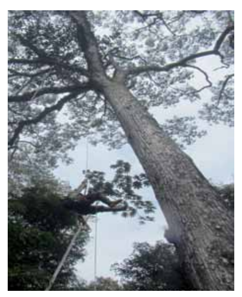
Staff climbing tree to place trap for insect pollinators in canopy.

The Activity team will also continue to ensure the continuous monitoring of both species until December 2015, as well as applying silvicultural treatments to stimulate the establishment of regeneration and in quantifying the production volume of fruits and/or certified seeds. The results will allow the design of a suitable methodology to manage seed stands in natural forests, and in developing guidelines for the production of seed trees earmarked for the production of certified seeds.