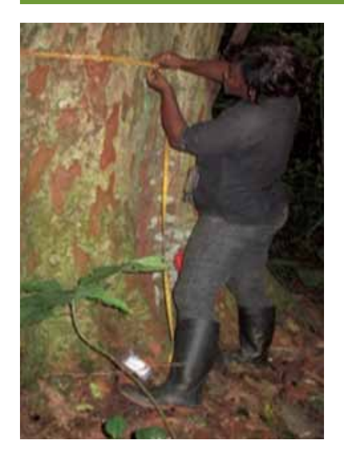
Measurement of diameter of a Pericopsis elata tree by a student from the University of Douala, Cameroon.

from April to November 2015 so as to allow experts to complete their specific activities in the field, mostly on matters related to phenology and silviculture studies. A total of nine experts have been recruited to implement nine specific activities in the field. They are from research institutions, including universities, and the National Institute for Development and Agricultural Research (IRAD).