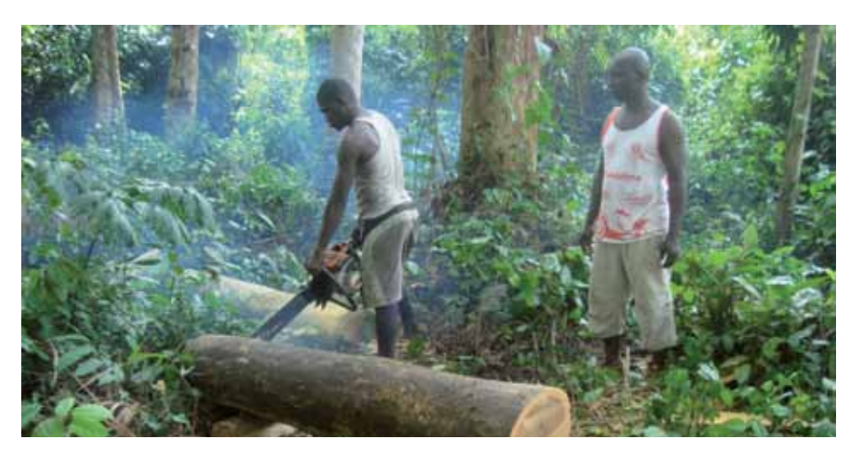
Collection of samples of wood of Pericopsis elata in the Bidou forest plantation in Cameroon by researchers from the University of Dschang

There was a delay in the delivery of the collected samples to the Double HELIX laboratory, due to delays in obtaining CITES permits for export. Another delay was caused by the change in the annual logging allocation to the GVI timber company that will be used to test the tracking system. As a result, the collection of samples from the forest to export has not started. The National Technical Committee in its meeting in May 2015 had noted these delays and recommended that (i)