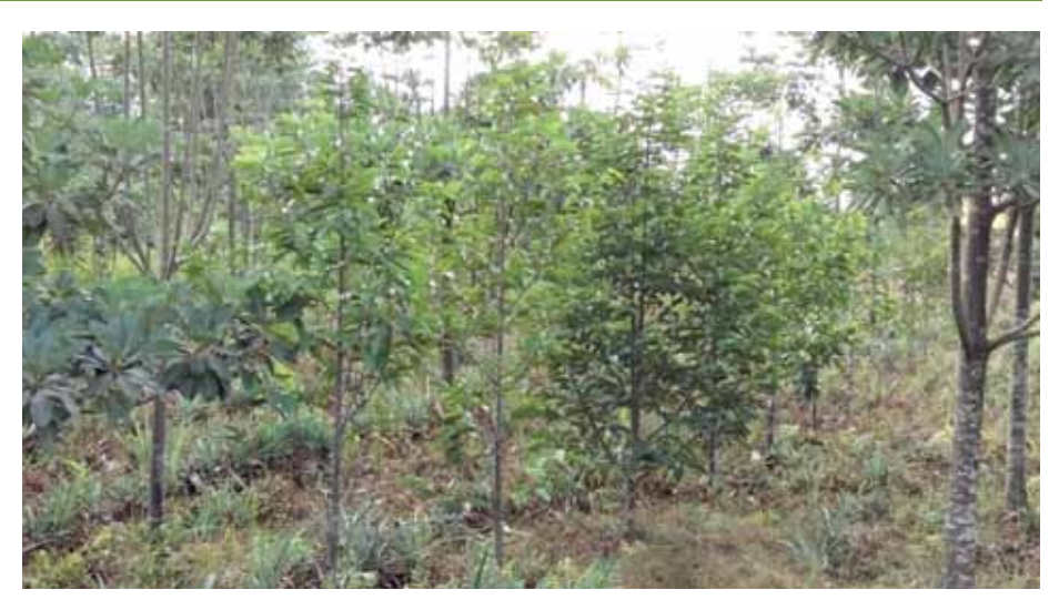
Mophological growth variation of ramin in the District Ogan Komering Ilir, South Sumatra.

of Logging Activities and Ramin Trade and they are expected to be recruited in September 2015. There is no potential risk in the execution of the Activity as plantation forest concession holders and the government have a strong commitment to ensure that ramin conservation activities are effectively implemented on the ground and as part of the operation of plantation forest management.