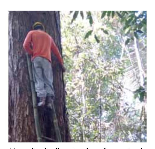
Measuring the diameter of a mahogany tree in the Brazilian Amazon.

Eighty-one new sample trees were measured for developing volume equations for the Seringal Macapá forest management unit. New measurements are planned to be carried out from August until the end of the harvesting season. It was found more efficient to take measurements in the log yards instead of at the felling areas, as in the log yard it is possible to have a loader to lift the logs, thus making it easier to take several girth measurements and bark thickness along the whole length of the log. So far, data from 206 sample trees were collected against a target of at least 300 trees. Measurements will continue to be taken to ensure enough data are available for the development of specific equations for super large individuals (trees with more than 1 metre diameter). It has been decided to develop equations for logs to increase precision when registering volumes of logs extracted. New equations will be tested after the next field trip. Two M.Sc. and two undergraduate students had the opportunity to collect data during field exercises for preparing their dissertations.