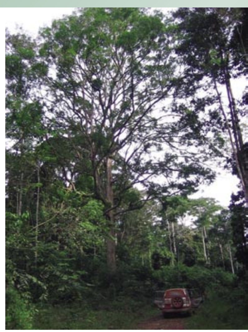
Road to recovery: Forest concession in Cameroon's East Province five years after logging. The large tree in the middle is Irvingia gabonensis , the fruits and seeds of which are highly sought-after by local people for food and income generation.