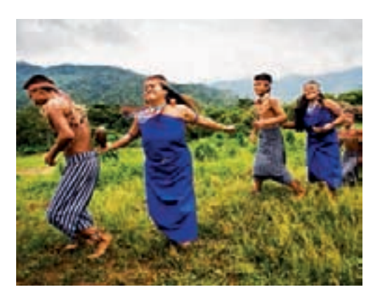
Promote regional and transboundary cooperation for biodiversity conservation and sustainable timber production.