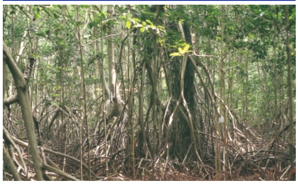
Dry mangrove forest on San Andres island.

National Project Coordinator, Ministerio del Medio Ambiente - ACOFORE, Bogota, Colombia; Fax 57–1 2432774; Email gdesanch@impsat.net.co