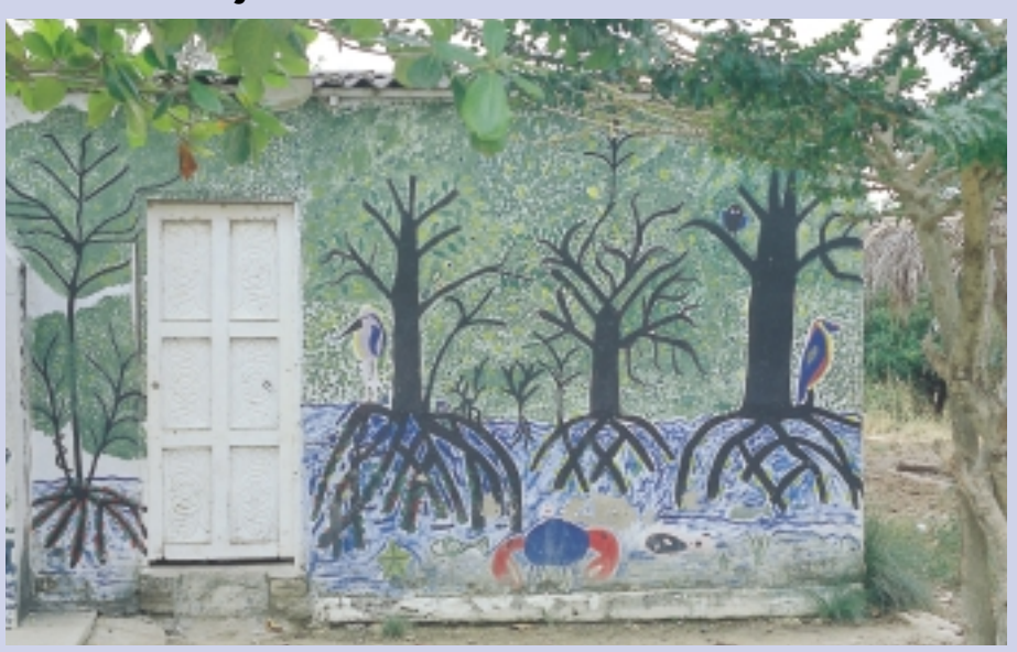
A wall of a building close to the mangrove nursery at Pascaballos, illustrating the community's interest in the pilot project.

The results obtained from two rehabilitation plots in the Caribbean region have shown Rhizophora mangle seedling survival rates of