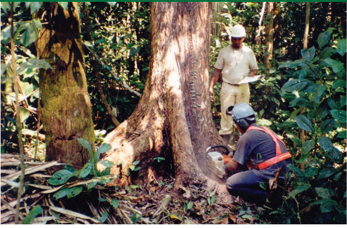
Timber: Reduced impact logging of mahogany at Acre field site.

The ITTO-CITES Programme for Implementing CITES Listings of Tropical Tree Species seeks to ensure that international trade in CITES-listed tropical timber species is consistent with their sustainable management and conservation. Initiated in 2007 with funding from the European Union, the Programme's specific objective is to assist national authorities to meet the scientific, administrative, and legal requirements for managing and regulating trade in important tropical tree species listed in the CITES Appendices such as Pericopsis elata (afrormosia) found in Central Africa, Swietenia macrophylla (big-leaf mahogany) found in Latin America, and Gonystylus spp. (ramin) found in Southeast Asia.