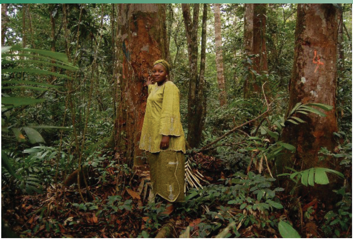
Outreach: The author in a biodiversity reserve near Libreville, Gabon.