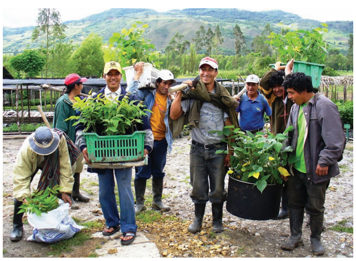
Planting out: Community reforestation programs in the Pomacochas area, Amazonas.

were organized for both community leaders and students, which resulted in a motivational experience for survey participants. These different processes were based on similar experiences such as those implemented in Maule, Chile (2008). The results of the questionnaire on preferred management objective are shown in Figure 1 on the previous page.