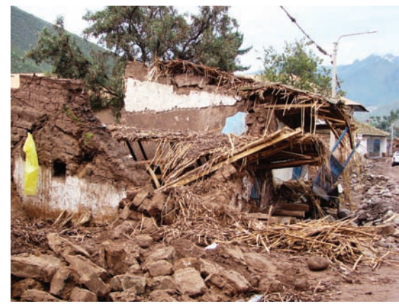
Sliding away: In the Amazon and Upper Andean regions, landslides and flash floods are now more frequent because the natural vegetation cover has been severely disturbed by human interventions.

community involvement is the key to finding a strategic partner to ensure the future protection of the environment based on the benefits derived from these actions by the local population.