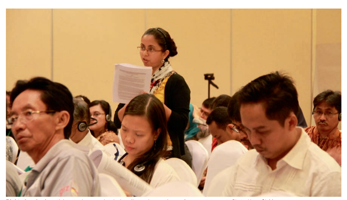
Right of reply: A participant raises a point during discussion on the conference statement.

emissions. For example, the majority of Indonesia's greenhouse-gas emissions come from land-use change and forestry. Clear and secure tenure rights and access to resources are essential for mitigating greenhouse-gas emissions from the land-use sector.