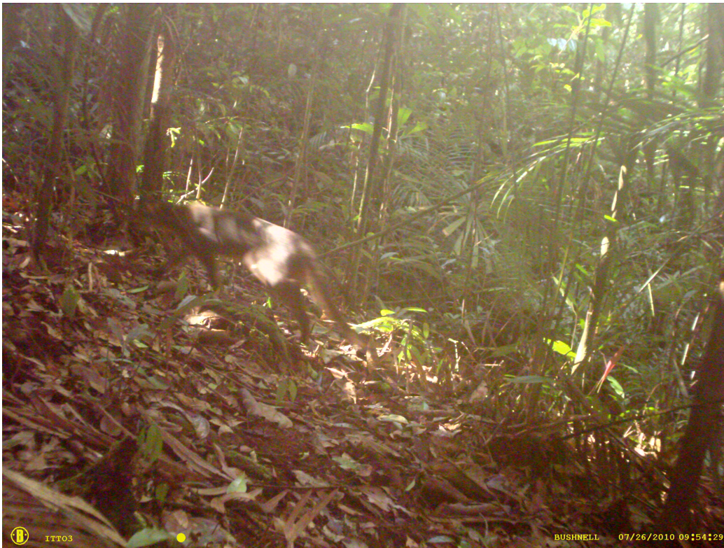
Bornean bay cat in Pulong Tau National Park (PTNP)