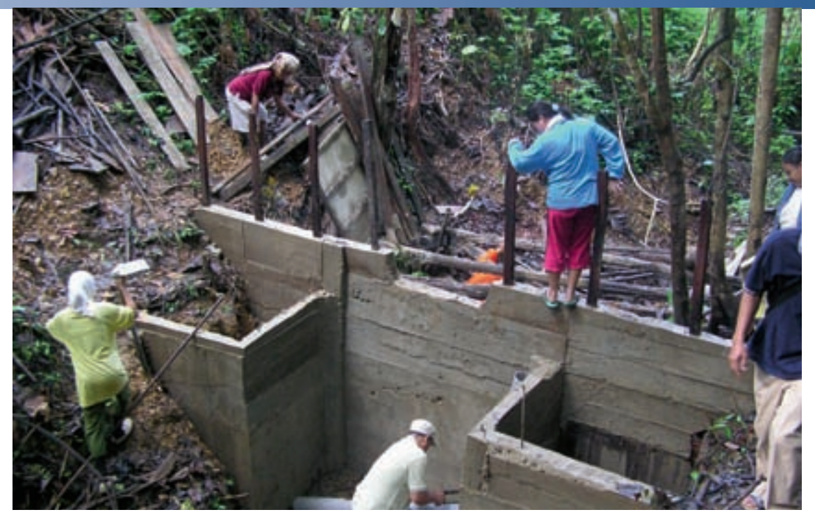
Concrete action: Longhouse members work with project staff to construct a valley pond.