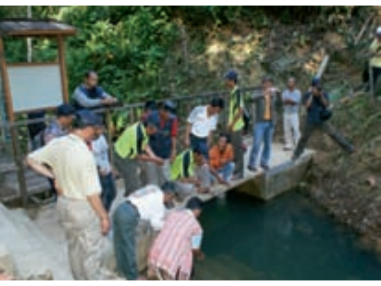
Deepening relationships: Officers from the adjoining Betung Kerihun National Park in Indonesia visit the Lanjak-Entimau Wildlife Sanctuary to exchange information and view local infrastructure, such as this valley pond.

The fourth phase of the ITTO project for the development of Lanjak-Entimau is drawing to a close and the question of sustainability is being raised. We will be able to secure our own national funding when a new community development division under the Forest Department is formed in October this year. In Sarawak there are private companies that would like to give money, but there is no mechanism by which this can take place. Another key element in the sustainability of the sanctuary is the maintenance of a reliable and competent management team. We should also promote international research in the area, because the results of the research will help to sustain the management of the area. In my view we should also continue collaboration with international agencies such as ITTO to ensure that we benefit from experiences elsewhere, and to help to maintain a collaborative transboundary approach. Involvement in the Heart of Borneo initiative is also desirable as a venue